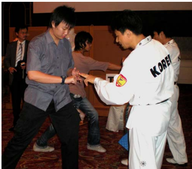
Students getting a hands-on taekwondo lesson.

"The funny thing was the kimbab making process looked very much easier in the Korean dramas that I watched. When I tried making kimbab during the cooking demonstration, my whole kimbab crumbled and went out of shape," she laughed.