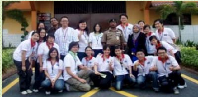
The visiting students in front of the Kajang Prison.

Upon reaching Kajang Prison, they were ushered in to listen to a few talks and briefing on the Prison Department and its role in crime punishment and prevention, as well as in drugs rehabilitation. In addition, they were also shown a video on caning as supplementary punishment to jailing. After the video screening, they were given an opportunity to learn more about psycho-education technique and psycho-drama applications during individual counselling with the prisoners. They were also lucky to watch the counselling of an inmate using the psycho-drama technique. Throughout the session, they were able to actively interact with the host by asking questions and having fruitful discussion. Some of the students also enquired about the possibility of undergoing their internship at the Kajang Prison.