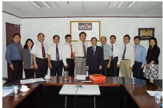
双方代表在交流会后合影。

双方代表在此次的交流会中磋商了初步的合作构思，为两所大学在未来的合作计划上迈开了重要的第一步。