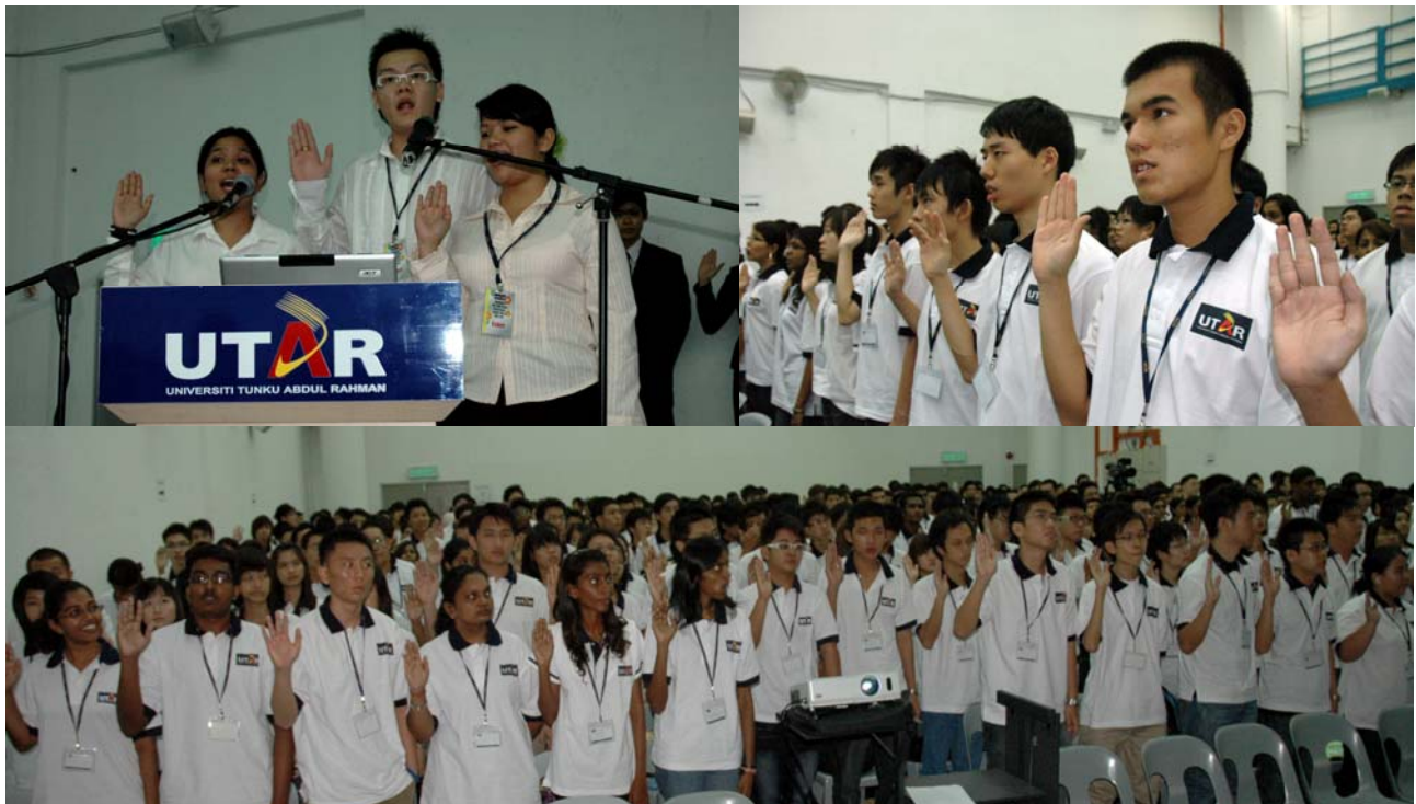
Freshmen taking their pledge during the mass call.