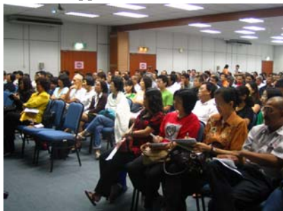
Participants listening attentively.

govern driving on a public road. It actually involves an actively-engaged, risk preventive mindset that anticipates possible accident risk situations and avoids them. Needless to say, 'thinking' driving means fewer accidents and fewer casualties, especially as the number of vehicles on the road have swelled exponentially while driving schools hardly