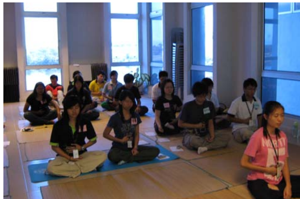
Students learn belly breathing.

Liew concluded, “Through this workshop, I hope the students have learned the right breathing techniques to relax and release daily stress as well as learned to love and nurture themselves through connecting with their inner selves. The more we love ourselves, the more we see love reflected in those around us.”