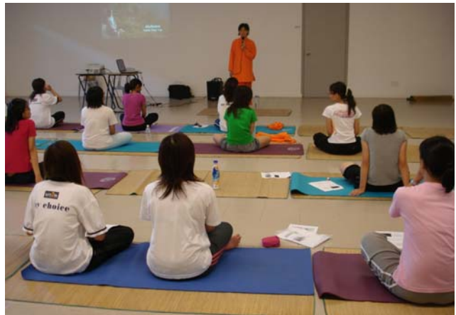
Workshop participants briefed on benefits of yoga.