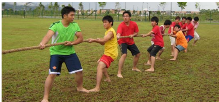
Tug of war, one of the events at UTAR Interfaculty Sports 2009.