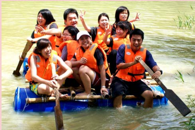
UTAR peer helpers having fun at the Camp.

UTAR students from all four Campuses relished in a time of fun and physical challenges at the recent ‘Peer Helpers Team Building and Self-Development Camp 2009’ held from 13 to 15 May 2009 at Broga Adventure Camp, Negeri Sembilan.