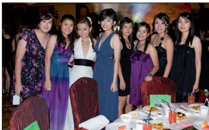
Students beaming with excitement at the ball.

that they were being spied on by anonymous photographers throughout the ball. A sudden announcement by the MC jolted them from their seats, followed by the screening of candid photos of eight students who had been selected as the 'best dressed' among the crowd at the ball.