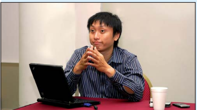
Chan imparting useful advice for success.

“Too many of us are not living our dreams because we are still living our fears. If there is no possibility of failure, the victory is meaningless,” Chan concluded.