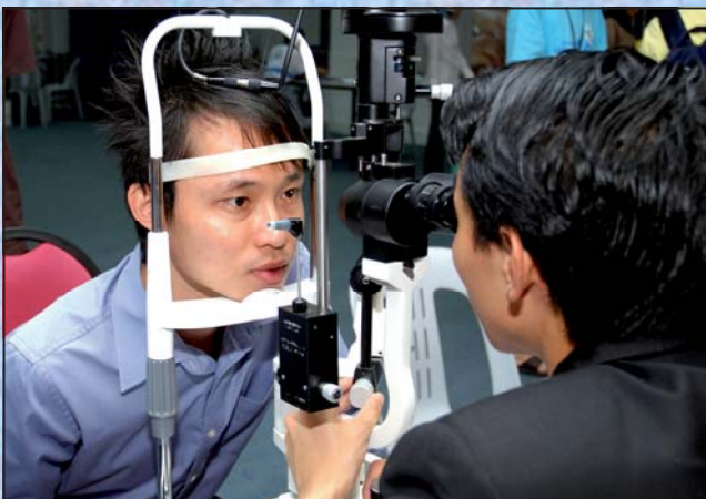
A UTAR staff getting his eyes checked during the event.