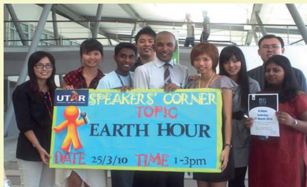
The participants of the Speaker Corner activities and their supporters.

for Earth Hour. In 2009, an estimated 611 megawatts-hours (MWH) of electricity was conserved, which is like shutting down 12 coal-fired power plants for an hour. On its third year, Earth Hour hopes to gain more participation to turn off lights for an hour in recognition of the event’s environmental advocacy towards a sustainable future.