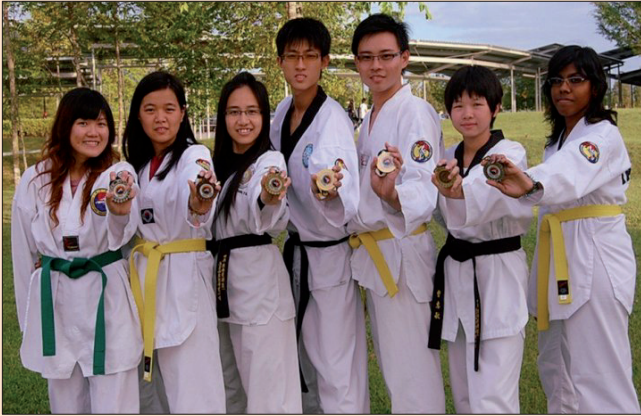
UTAR's Magnificent 7 showing their medals