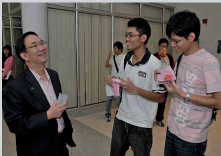
Students chatting with the President