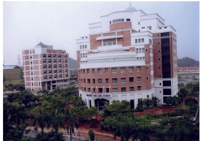
FMHS in Sungai Long Campus (right building)