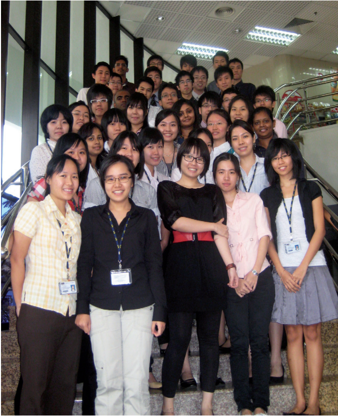
Inaugural batch of UTAR MBBS students

UTAR made history again when it recruited its inaugural batch of 39 Bachelor of Medicine and Bachelor of Surgery (MBBS) students in May 2010.