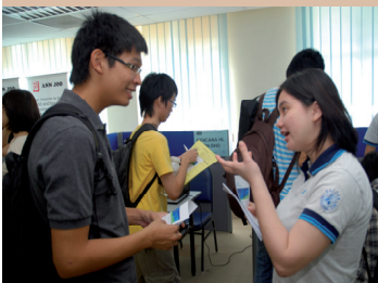
A student getting information

A total of 43 companies occupied 52 booths during the Career Day for the Faculty of Engineering and Science at UTAR campus in Setapak on 30 July 2010.