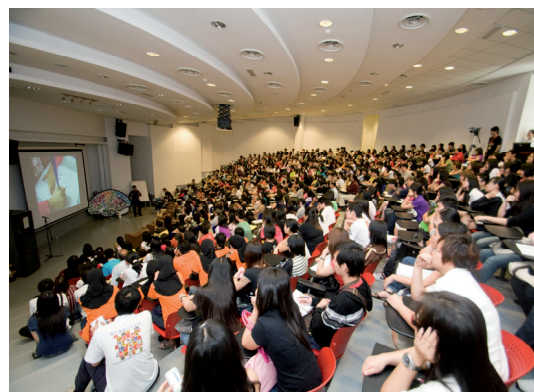
The crowd at one of the talks

The festival attracted a huge turnout. Some came from as far as Kedah and Kuala Lumpur.