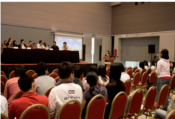
Q&A in session

Organised by Department of Alumni Relations and Placement, the workshop aimed at encouraging graduating students to take up the option of postgraduate studies overseas or locally.