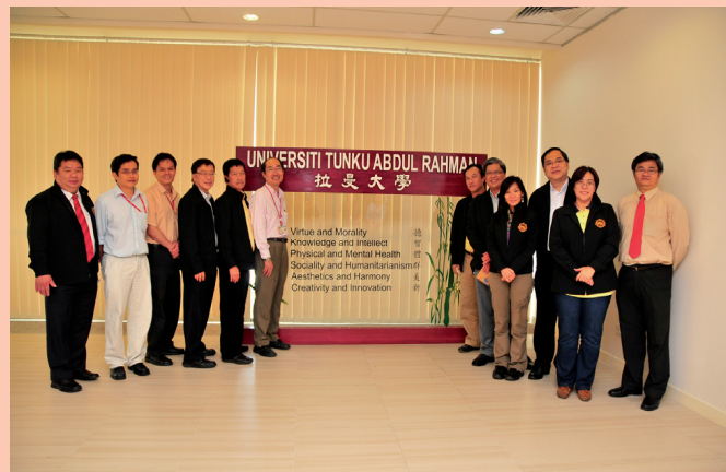
All smiles after a fruitful discussion

Among the issues highlighted were the exemptions for SFFLA diploma students to pursue a UTAR bachelor degree and qualified teaching staff for the programme.