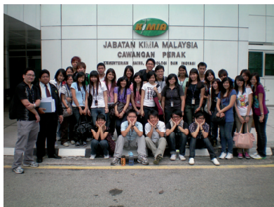
Chemistry Society members at JKM

UTAR Chemistry Society organised the visits to