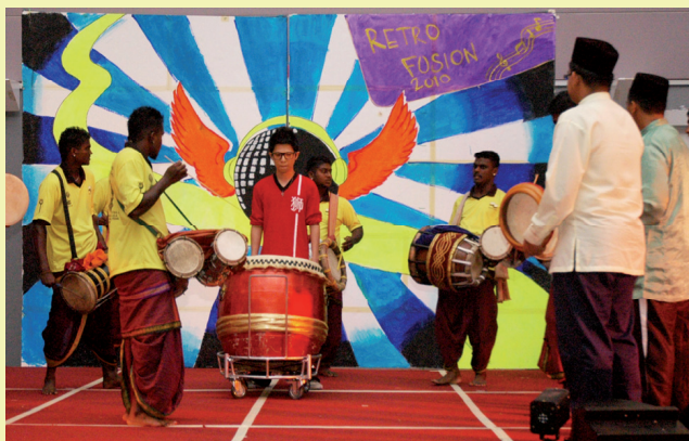
A fusion of drum beats signifies the unity of different cultures

Cultural Night 2010, which was held on 3 July 2010 at UTAR Perak Campus, opened with great anticipation and expectation in the spirit of 1Malaysia.