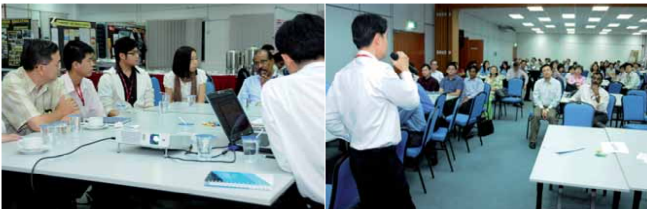
Some of the scenes at the research workshop. UTAR academics and researchers brainstorm ideas for their research projects.

It is in the plan that there would be more research workshops to come in the near future. This is part and parcel of the transformation process that UTAR has to go through in the area of R&D. The transformation process is critical and crucial in ensuring that UTAR is on track in becoming a teaching and research University that will be respected in Malaysia and the world over.