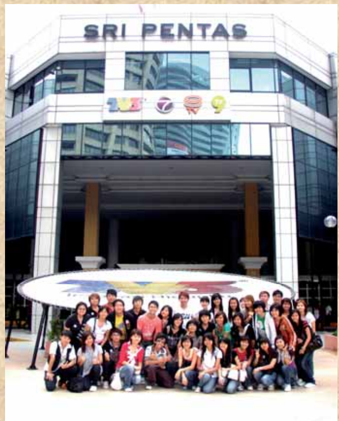
The visiting students immortalised their visit at the entrance of Sri Pentas.

Most of the students are die-hard fans of 8TV programmes. 8TV targets the younger block of viewers with its notable programmes such as 8 E-News, 8TV Mandarin News, I Wanna Be a Model, Project Superstar and Summer Live Concert. 8TV is the sister channel of TV3, ntv7 and TV9 and all these stations are based at their headquarters in Sri Pentas, Bandar Utama.