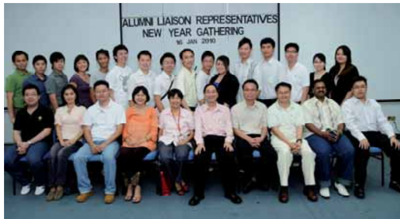
The Alumni Liaison representatives with the President and UTAR management after the gathering.