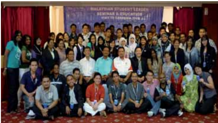
A group photo of the participants during the launching ceremony.

This six-day programme provided about 60 students leaders from 46 private institutions of higher learning a platform to develop their potential to be future leaders of the world, in addition to enhancing