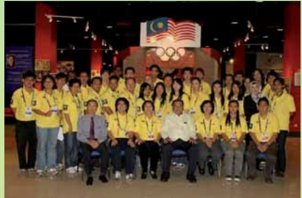
A group photo of the NOA participants and the organisers.

On the final two days, the participants reflected back on their activities throughout this programme as well as meeting with past Malaysian Olympians who shared their Olympic experiences with the participants. In addition, they also learned about careers in the sports industry as well as within the government sectors. Being young athletes, they then had an opportunity to discuss and share their views during the Action Plan for the future of Olympians session. The final night saw them gathered for a gala dinner and presentation. The final agenda of the event was evaluation and reflection of the NOA. The 13 th NOA closing ceremony was attended by the President of OCM and International Olympic Council member, Yang Amat Mulia Tunku Tan Sri Imran ibni Almarhum Tunku Ja'aafar.