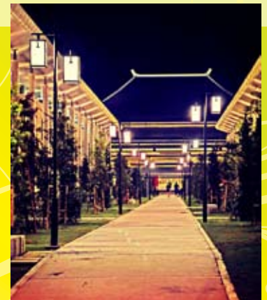
Night view of Dewan Tun Dr Ling Liong Sik.