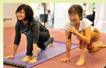
Hargai hidup >p20