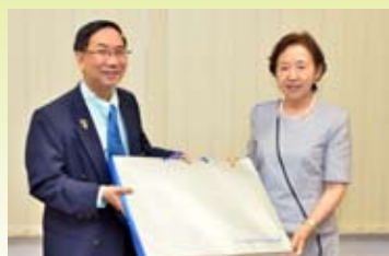
Dongseo University, Korea and Josai University, Japan >p11