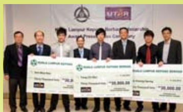
UTAR reaps rewards of collaborative efforts >p3