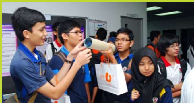
Pelawat mencuba mikroskop ringkas.

Bagi memeriahkan sambutan ulang tahun UTAR yang ke-10, Pameran Penyelidikan dan Pembangunan (R&D) telah dilancarkan di Kampus Petaling Jaya UTAR pada 6 dan 7 Julai 2012. Pameran itu bertujuan untuk memupuk minat pelajar dalam bidang sains dan penyelidikan.