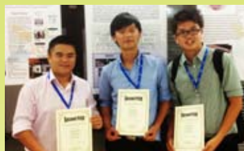
Trio wins Intel Cup second prize >p12