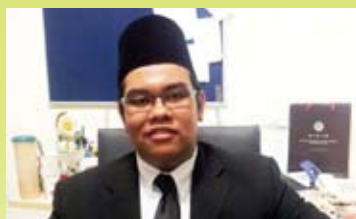
Path less travelled >p7