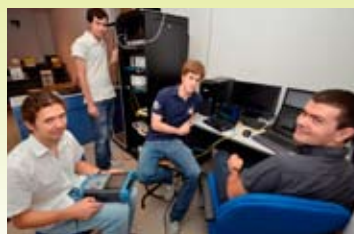
French-tastic Four >p13