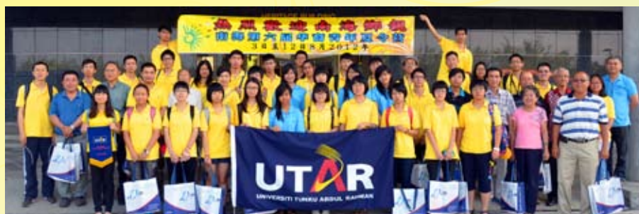
The participants of the 6th Nanhai District Ethnic Chinese Youth Summer Camp.

A total of 50 participants of the 6th Nanhai District Ethnic Chinese Youth Summer Camp visited UTAR Perak Campus on 6 August 2012. The participants comprised both Chinese nationals and Malaysian Chinese were taken on a campus tour, which included a visit to the newly-completed Dewan Tun Dr Ling Liong Sik.