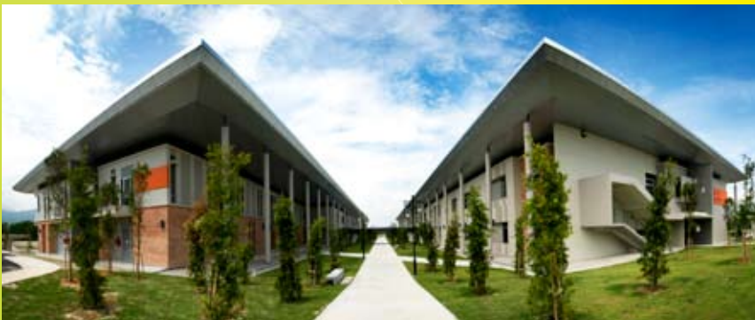
Buildings of FAS, ICS, FICT and IPSR Labs.

Measuring 334,506 sq ft, Phase 2 is the latest addition to UTAR Perak Campus' build-up area, which includes the Dewan Tun Dr Ling Liong Sik, Student Pavilion II, Lecture Complex II, Faculty of Information & Communication Technology (FICT), Faculty of Arts & Social Science (FAS), Institute of Postgraduate Studies & Research laboratories (IPSR), and Institute of Chinese Studies (ICS).