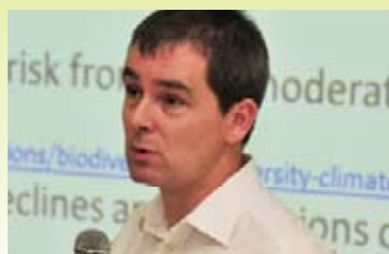
Data Challenges in Multimedia Environmental Setting >p4