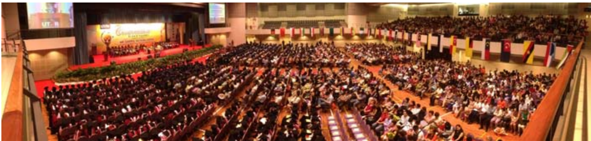
Convocation in progress in Dewan Tun Dr Ling Liong Sik