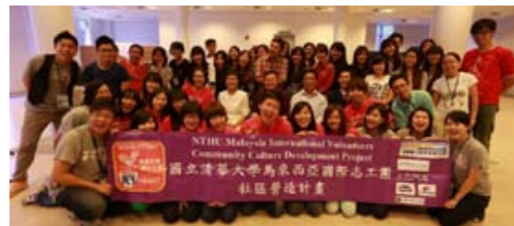
拉曼大学与国立清华大学志工团相见欢。

今年，国清大志工团第二次到访务边，主要专注于务边的宗教文化历史。国清大志工团共分为6组，所到之处包括尼泊尔、坦桑尼亚、狮子山、贝