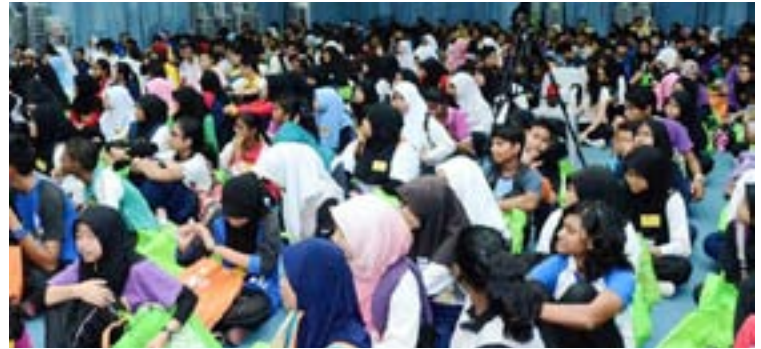
Sesi taklimat daripada penganjur sebelum kem bermula

Selain mewujudkan kesedaran dalam kalangan pelajar tentang kepentingan penguasaan bahasa Inggeris, terutamanya dari segi kefasihan dalam pertuturan, kem bahasa Inggeris ini juga bertujuan untuk menggalakkan interaksi pelajar dari sekolah berlainan di samping memupuk sifat kepimpinan dalam kalangan