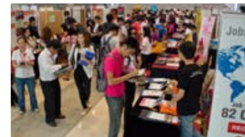
Huge turnout at UTAR Perak Campus Heritage Hall despite a heavy downpour earlier