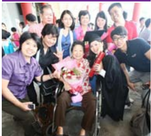
UTAR graduate (in graduation gown) poses with her family members and wheelchair-bound grandmother

The colossal hall, teemed with ebullient faces and ear-splitting applause, morphed into an irresistible congregation citadel for graduands, their parents, relatives, friends and guests of the University. The hall was deluged in an entrancing aroma of auspice. Camera lights flickered at every cranny of the spectacular structure before, during and after each convocation session.