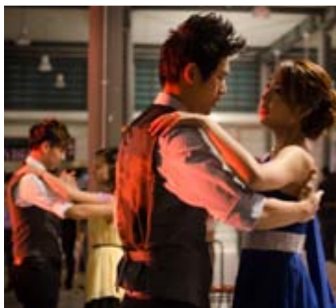
The record-breaking waltz

As night fell, 234 pairs waltzed their way into the Malaysia Book of Records for registering the highest number of waltz couples in a single occasion during the Waltz with Love II event held at Student Pavillion II at UTAR Perak Campus on 27 July 2013. The night full of happenings was surely memorable to all the couples.