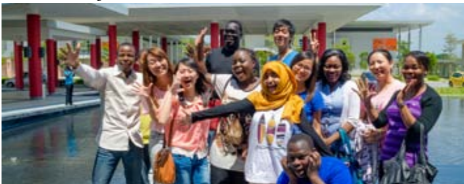
UTAR international students at the exterior of Dewan Tun Dr Ling Liong Sik

During the get-together, the students were taken for a campus tour at the award-winning campus. The students also shared their reasons for choosing UTAR as their destinations for higher education.