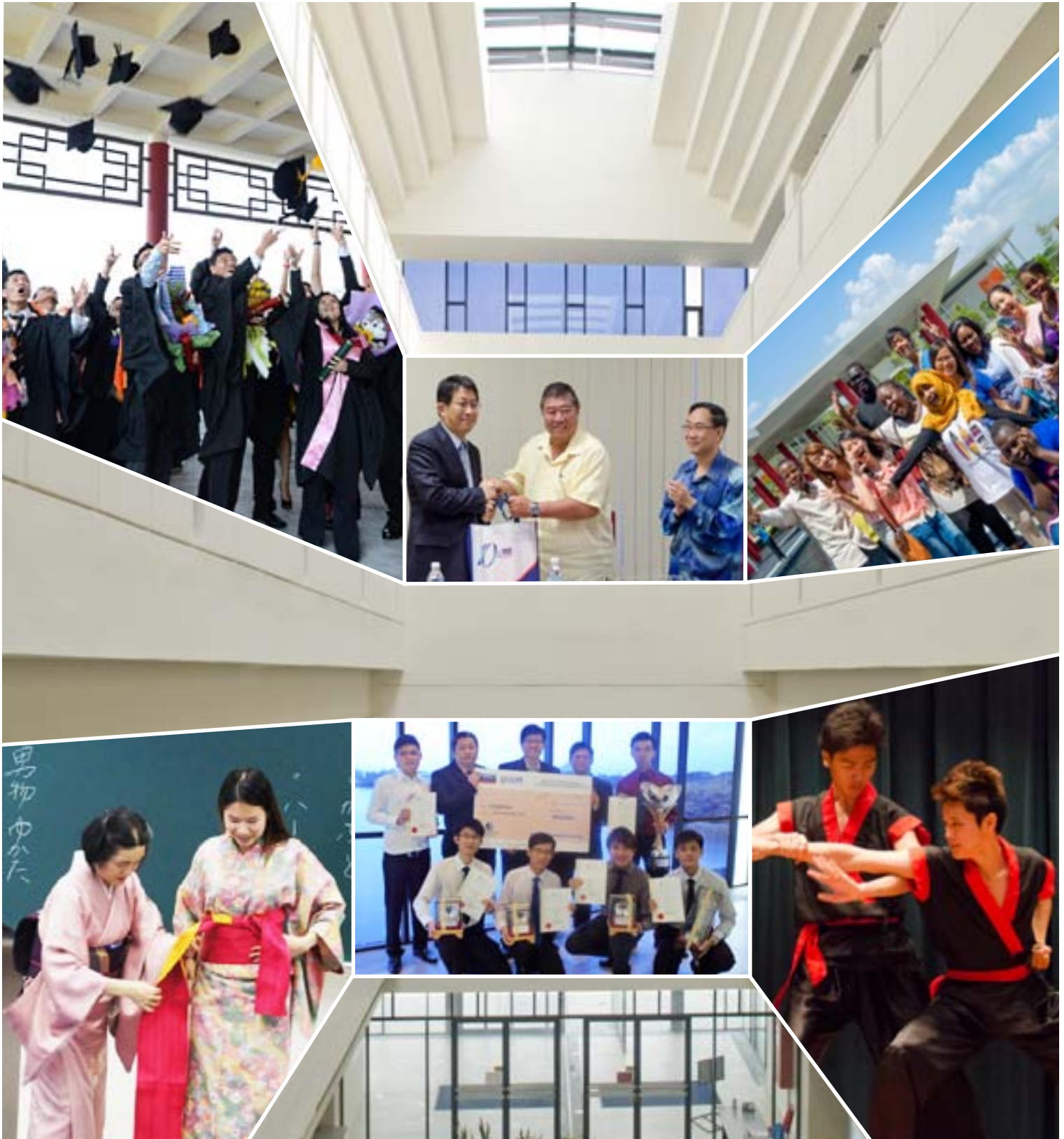
UTAR Main Library Building, Perak Campus