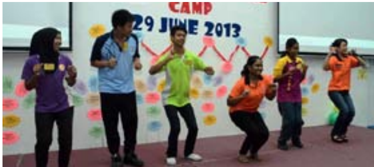
Sesi suai kenal dengan para pelajar