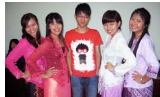
UTAR students with a friend from WHU