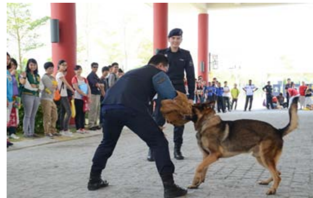
Demonstration by K9 Unit at UTAR Perak Campus