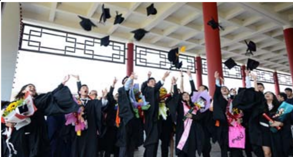
Graduates in joyous mood at the convocation

At the end of session four, as lights were dimmed and the hall enveloped in silence, one thing remained clear though; UTAR has successfully hosted its 17 th Convocation. UTAR endeavours to continue to grow on an upward trajectory and proliferates the number of its alumni which currently stands at 32,370.