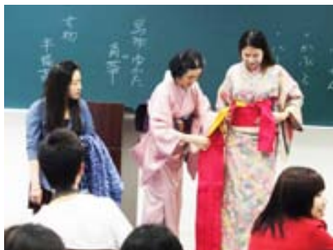
Seorang pelajar UTAR mencuba Kimono , pakaian tradisi Jepun

Peluang untuk mengikuti satu program lawatan selama 12 hari di Universiti Soka di Tokyo, Jepun telah berjaya dimanfaatkan