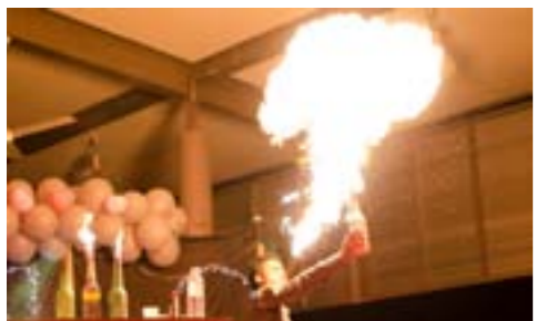
Side entertainment: a bartender performing a fire-breathing act

As night fell, 234 pairs waltzed their way into the Malaysia Book of Records for registering the highest number of waltz couples in a single occasion during the Waltz with Love II event held at Student Pavillion II at UTAR Perak Campus on 27 July 2013. The night full of happenings was surely memorable to all the couples.