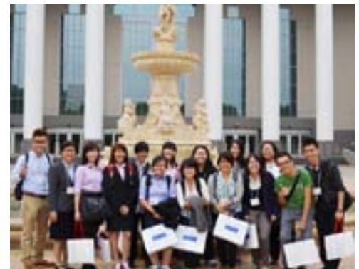
Para peserta dari UTAR bergambar di Universiti Soka

Salah satu aktiviti kemuncak lawatan tersebut ialah pelancaran satu sesi kuliah khas yang bertajuk 'Humanistic Education