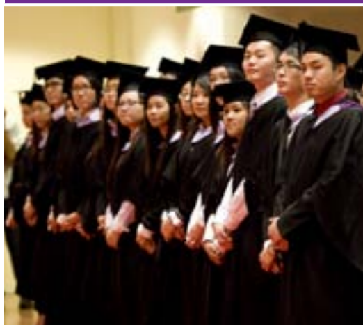
A very proud moment for UTAR graduates

A total of 1,955 students graduated from 13 Master's and 48 Bachelor's (Honours) programmes in the 17 th UTAR Convocation held at the stately Dewan Tun Dr Ling Liong Sik of UTAR Perak Campus in Kampar from 23 to 25 August 2013.