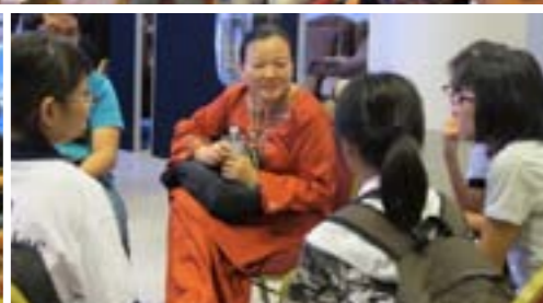
师生小组交流活动