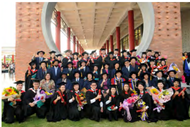
Pioneer batch of Bachelor of Medicine and Bachelor of Surgery graduates