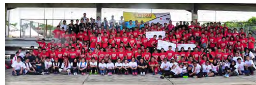
The participants, organisers and representatives from participating companies

"M100 is meant to connect employers and students in a different manner and through this GTI media hopes to provide students with a chance to showcase their abilities, leadership and teamwork and change the landscape of graduate employment in Malaysia."