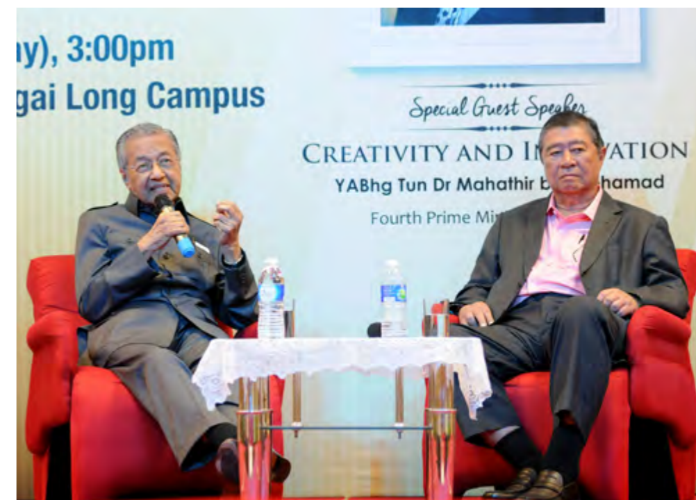
Tun Mahathir speaking on the importance of the English language

He advocated that a doctor's approach to diagnosing an illness is an approach similar to solving a problem. It is methodical and systematic. We probe, gather data, diagnose the problem and then work out a solution. He elaborated that this approach is also