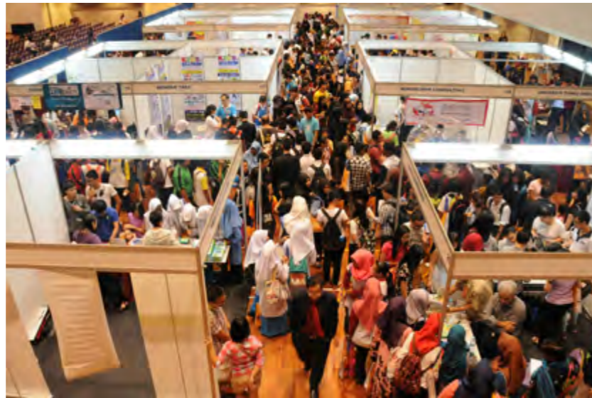
Visitors thronging the exhibition hall

showcased mind games, magic of science, MENSA admission test, Leonard Personality Inventory test and other mental literacy related products.