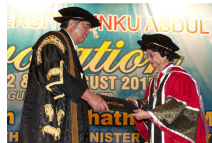
Tun Siti Hasmah (right) receiving her Honorary Doctorate Degree from Tun Ling