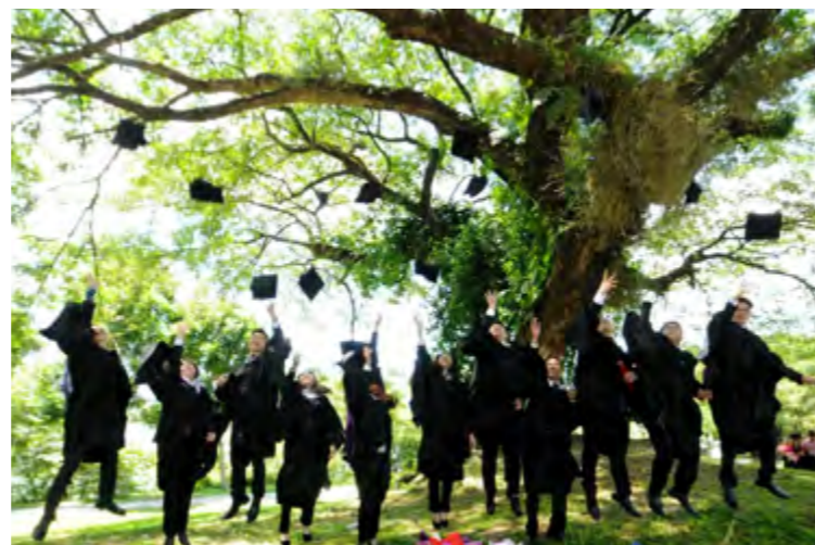
Graduates in jubilant mood