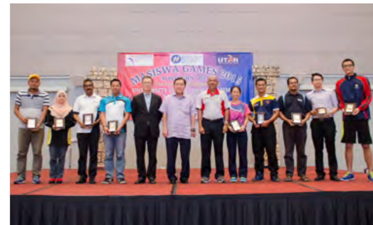
Officials from all the 11 higher learning institutions posing for a group photograph after receiving souvenirs from organiser