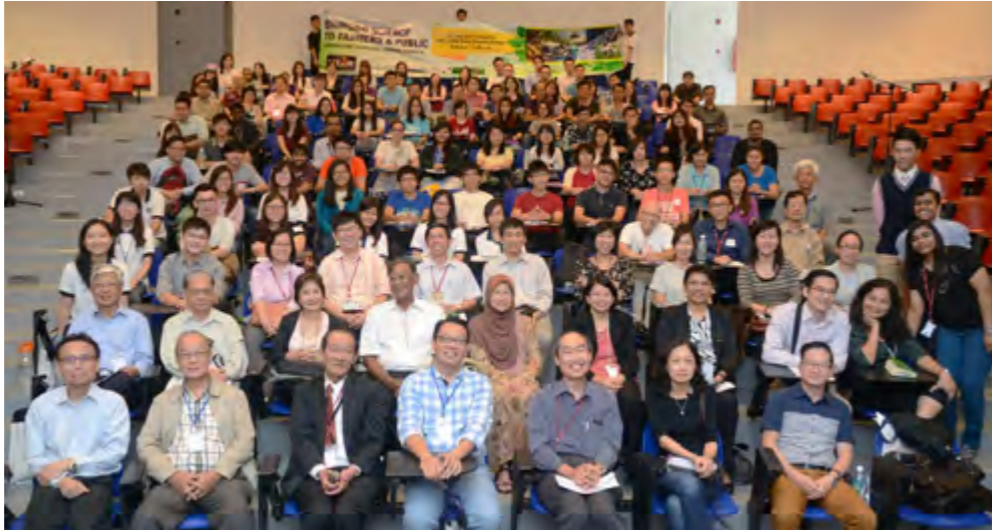
Group photo of the organising committee, speakers and participants