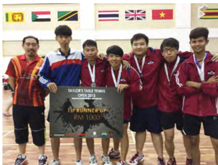
UTAR table tennis team

"We felt great to be part of these games and win medals for our university. The tournaments were exciting, enjoyable and a great