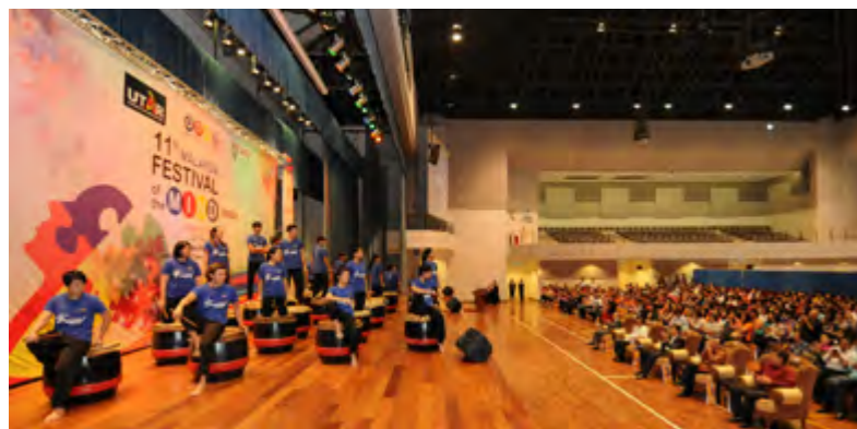
UTAR Wushu Club performing the 24-Festive Seasons Drum