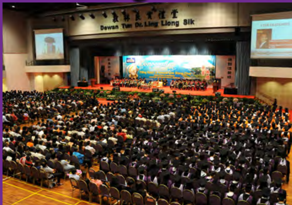
UTAR 21st Convocation in Dewan Tun Dr Ling Liong Sik

Universiti Tunku Abdul Rahman (UTAR) held its 21st Convocation at the Dewan Tun Dr Ling Liong Sik in UTAR Kampar Campus, Perak from 21 to 23 August 2015. A total of 2,281 graduands from 81 programmes comprising 61 Bachelor (Honours) degrees, 16 Master's degrees and four PhDs received their convocation scrolls in four sessions held over the three-day period.