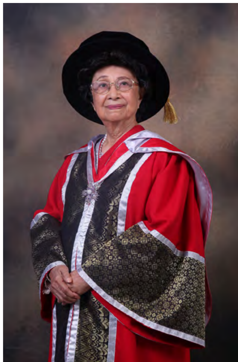
Tun Dr Siti Hasmah

For her 23 years of public service, her voluntary work, and her leadership in the fields of public health, literacy and drug abuse control, Tun Dr Siti Hasmah received many honours and awards. His Majesty the Yang di-Pertuan Agong (Supreme Ruler of Malaysia) as well as Their Royal Highnesses the Sultan of Selangor and the Sultan of Kedah and Their Excellencies the