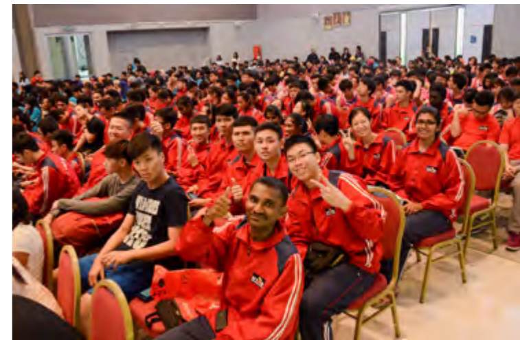
Participants of MASISWA games at the closing ceremony