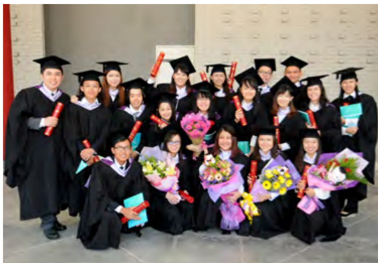
Faculty of Science graduates smiles for a group photo