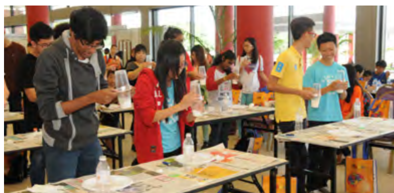
A group of students at the science exhibition