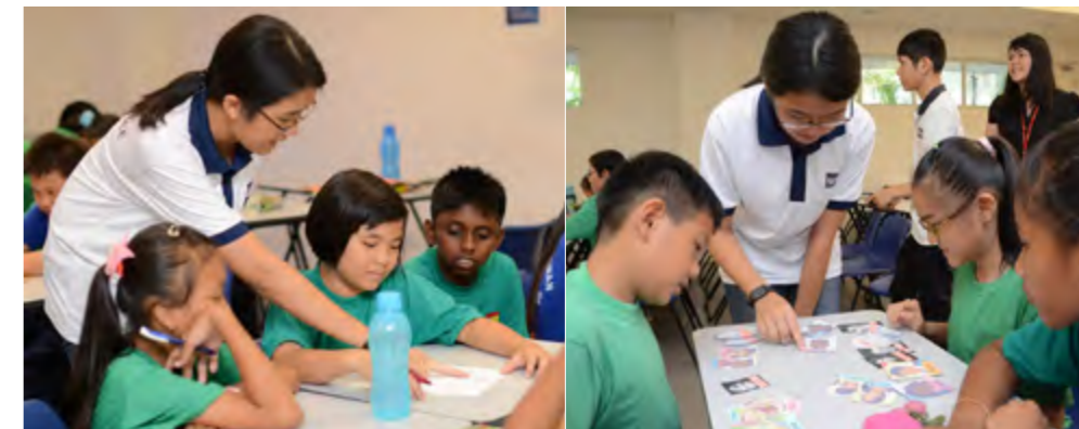
Students participating in the camp

The camp involved several English Language undergraduates to facilitate the primary school students in language games such as 'Word Family Game', 'Rhyming', 'Making Mental Images' and 'Treasure Hunt' to spark interest in learning English.