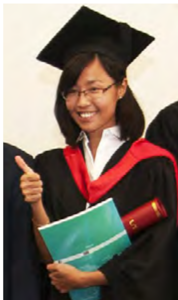
MBBS graduate Ang