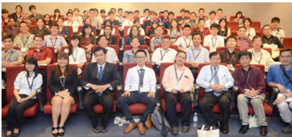
Group photo of 3rd NPFASS 2015 speakers, organising committee and participants

The two-day seminar officially came to an end after an announcement of winners for best oral and poster presentations.