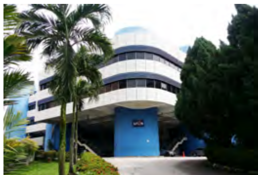
PJ Campus PD Block