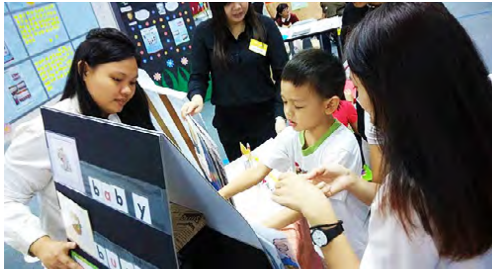
ECS students assisting a participant at the 'mix-and-match' booth

in designing practical and marketable teaching materials. Much attention and time have been spent on the making and setting up of the teaching aids on display today. The various displays are not only for children with normal learning abilities, but also for children with special needs."