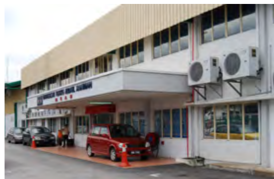
PJ Campus PE Block

Some of the main facilities in the new campus building are: