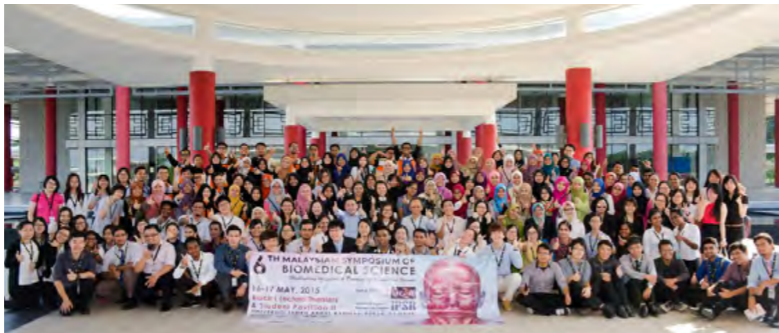
Group photo at the majestic Dewan Tun Dr Ling Liong Sik