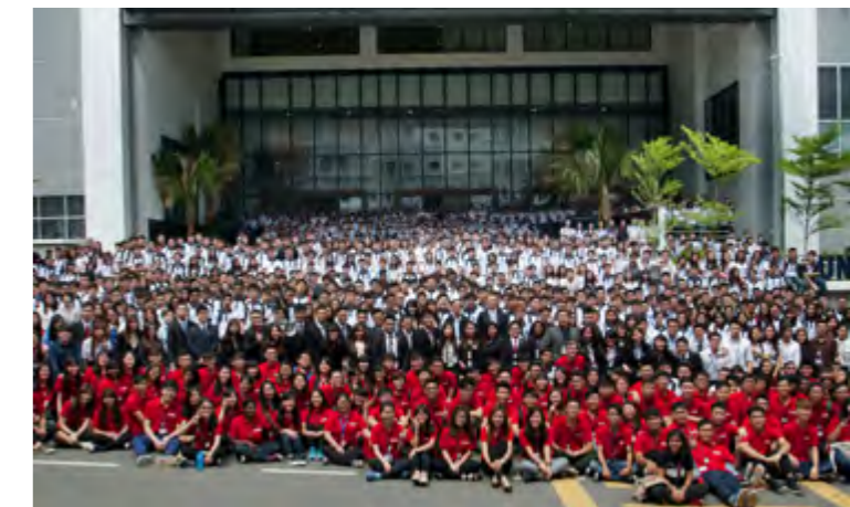
New students, orientation committee members and staff at the Sungai Long Campus