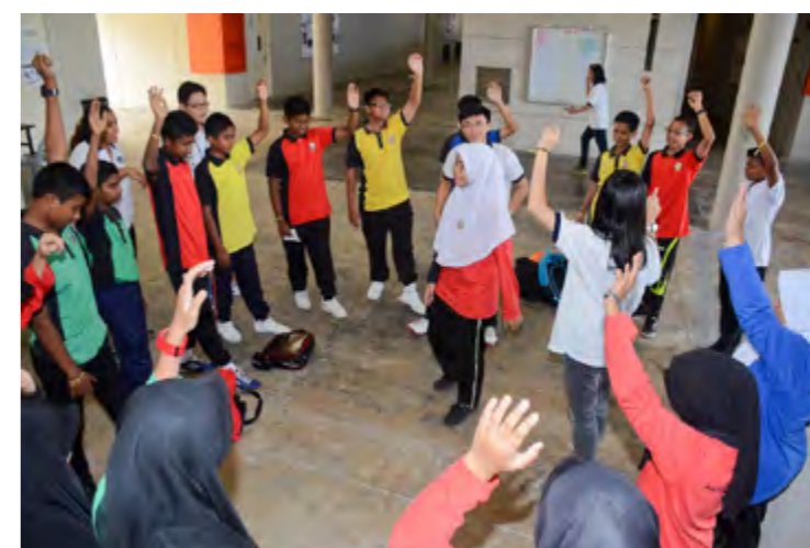
Participants in the ice-breaking session

Classes aside, the EXE Camp also introduced intriguing language games such as 'Reading Bingo', 'Code Breaker Game' and 'Visualising Riddles' which Form One student Zulaikha binti Sidek thoroughly enjoyed. "I'm happy to learn how to use synonyms, vocabulary and