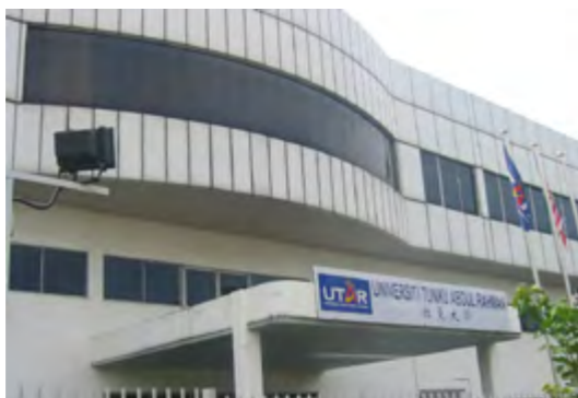
PJ Campus PC Block