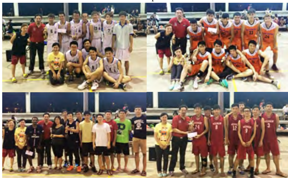
Clockwise from top, left: The winning teams comprising Little Apple , Secret Service , Mocking Jay and Falcons Flare pose for their group photograph

After the finals, 16 players were chosen to undergo training to be part of the UTAR basketball team. Over the years, UTAR's basketball team has won many competitions with many skilful players making the team proud.