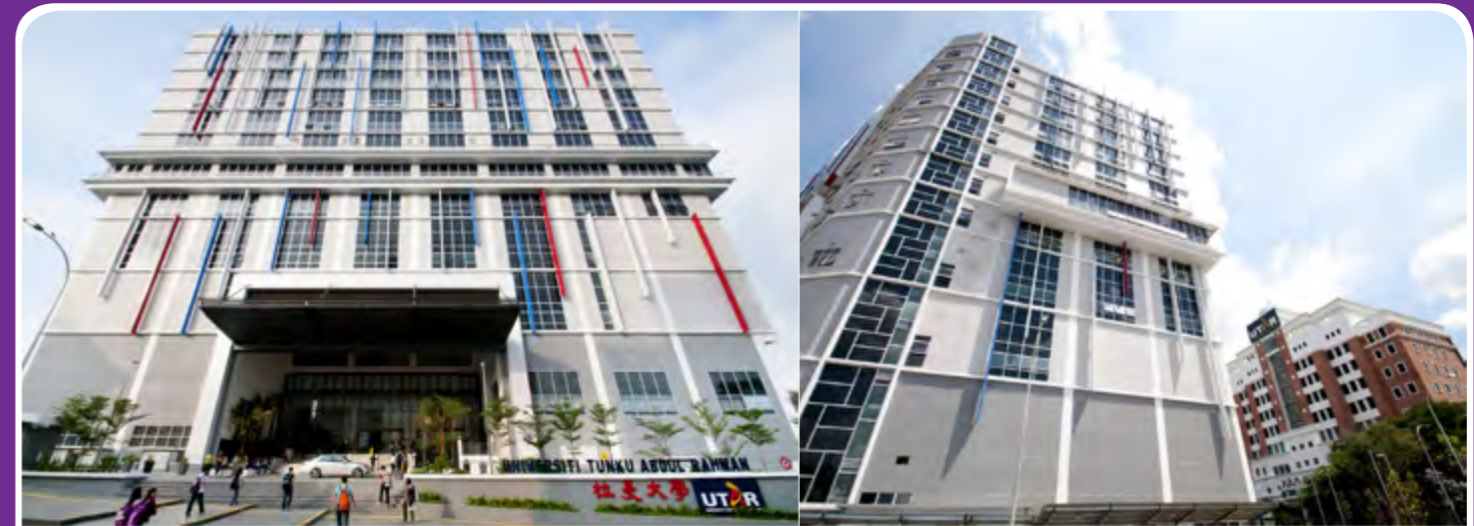
UTAR Sungai Long Campus

UTAR welcomed the new students of the June 2015 intake with orientation activities from 1 June to 5 June 2015. It was a special moment for the university as the new facilities finally debut to the students.