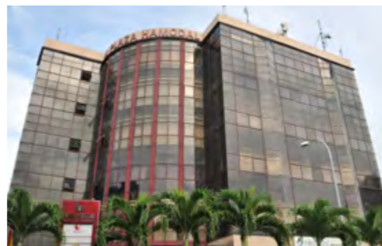
PJ Campus Plaza Hamodal