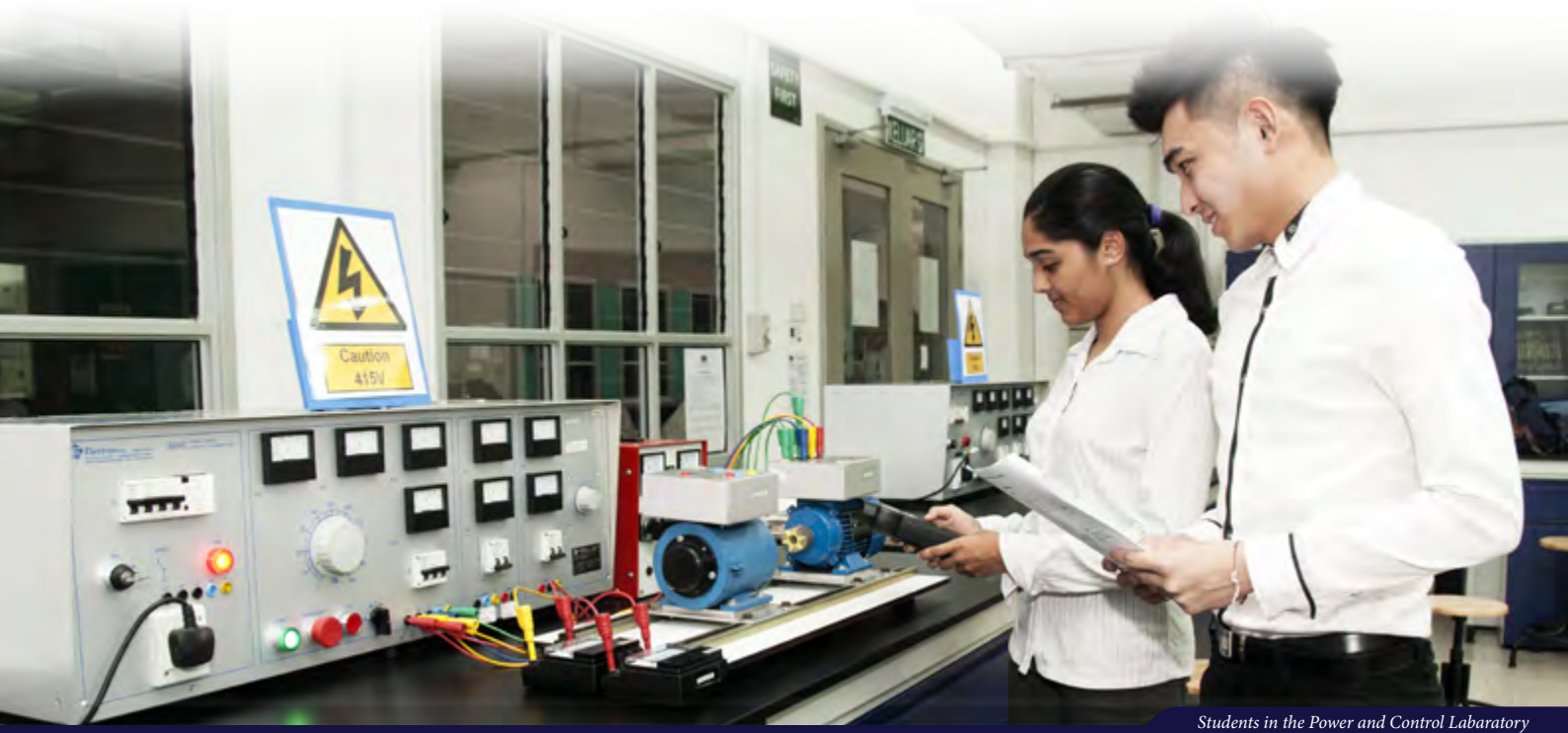
Students in the Power and Control Laboratory