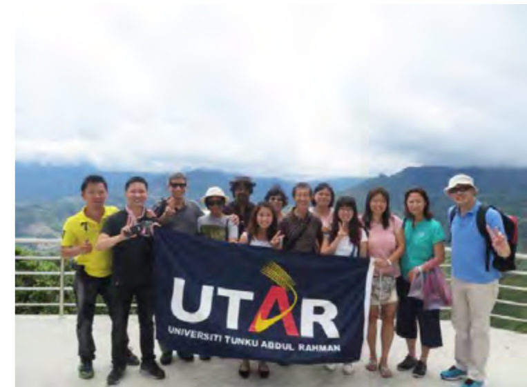
UTAR alumni posing for a group photo in Kundasang, overlooking the majestic Mount Kinabalu

networking opportunities. For the trip, DARP gathered alumni who love to travel, some from as far as Penang, Sandakan and Tawau, to visit alumni living in Kota Kinabalu.