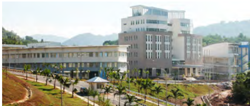
KL Campus in Setapak