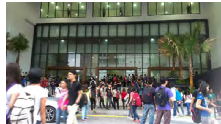
First day of classes at the Sungai Long Campus

The consolidation of all its Klang Valley campuses to Sungai Long enables UTAR to provide an improved learning environment to enhance the learning experience of its students with better library facilities, a more efficient management of resources in the building and with better security in the one-building complex. This will also provide more opportunities for the UTAR community of staff and students to network and participate in the various programmes of the university which will make the campus a vibrant hub of activities. UTAR now owns both its campuses, reflecting the foresight of the university in gathering its strength and resources in anticipation of greater growth ahead.