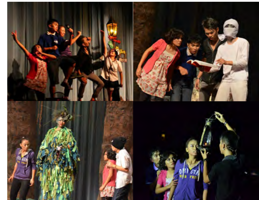
The main casts showcasing their acting talents

The performance depicted five students who lost their way in the jungle but eventually forged closer bonds as they overcame all odds, to find their way out. The story was an allusion of people blinded with materialism lost in darkness, only freed once they discover the humanity in their hearts.