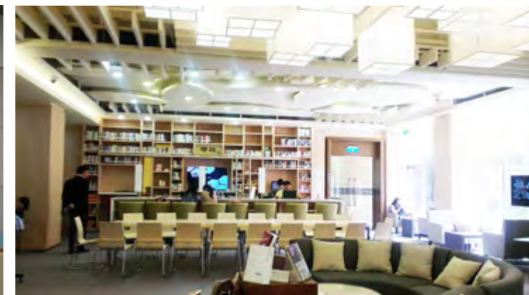
Modern student-centred library and resource centre at FCU