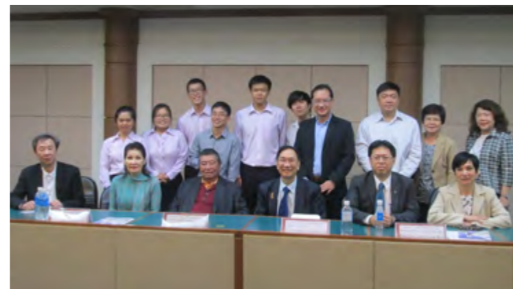
Delegates with some Malaysian students attending Hai Qing Ban (海青班) at FCU

Tanzanians studying full-time in USTAR. The subsequent USTAR study tour to Sydney and Adelaide for collaborations resulted in student exchange training programmes between TAR UC Johor branch and TAFE College.