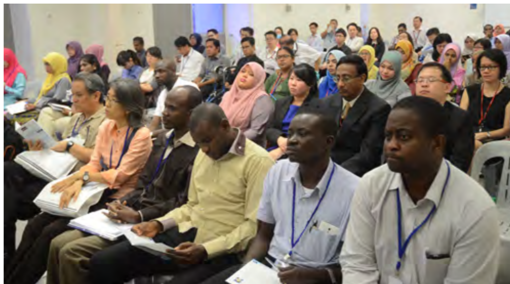
Participants at the BAFE 2015

a very constructive platform for more interdisciplinary studies."