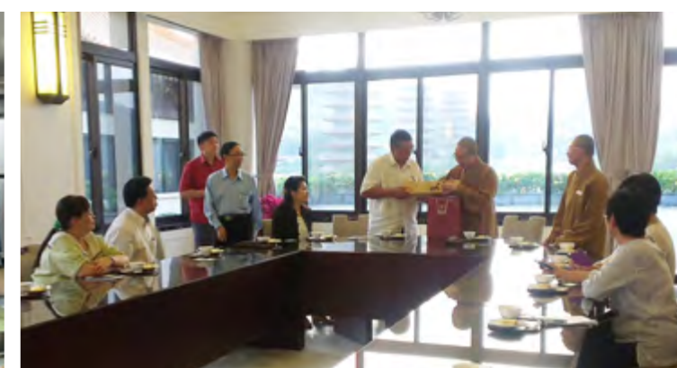
Meeting with the Reverend at Fo Guang Shan