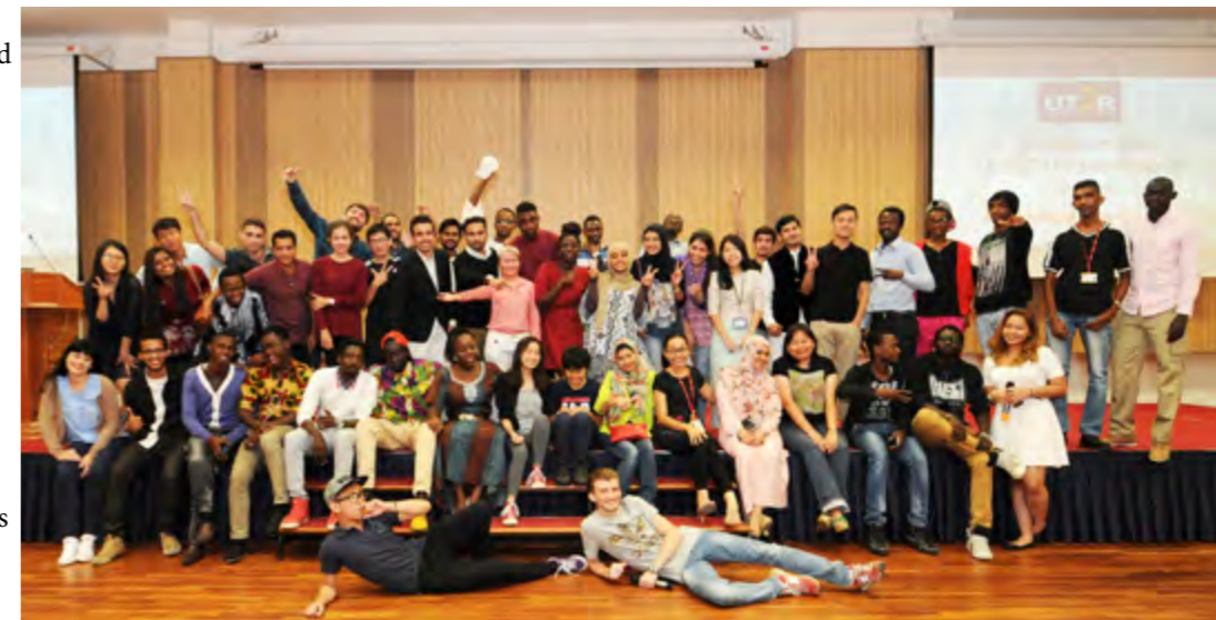
UTAR international students from Kampar and Sungai Long Campus