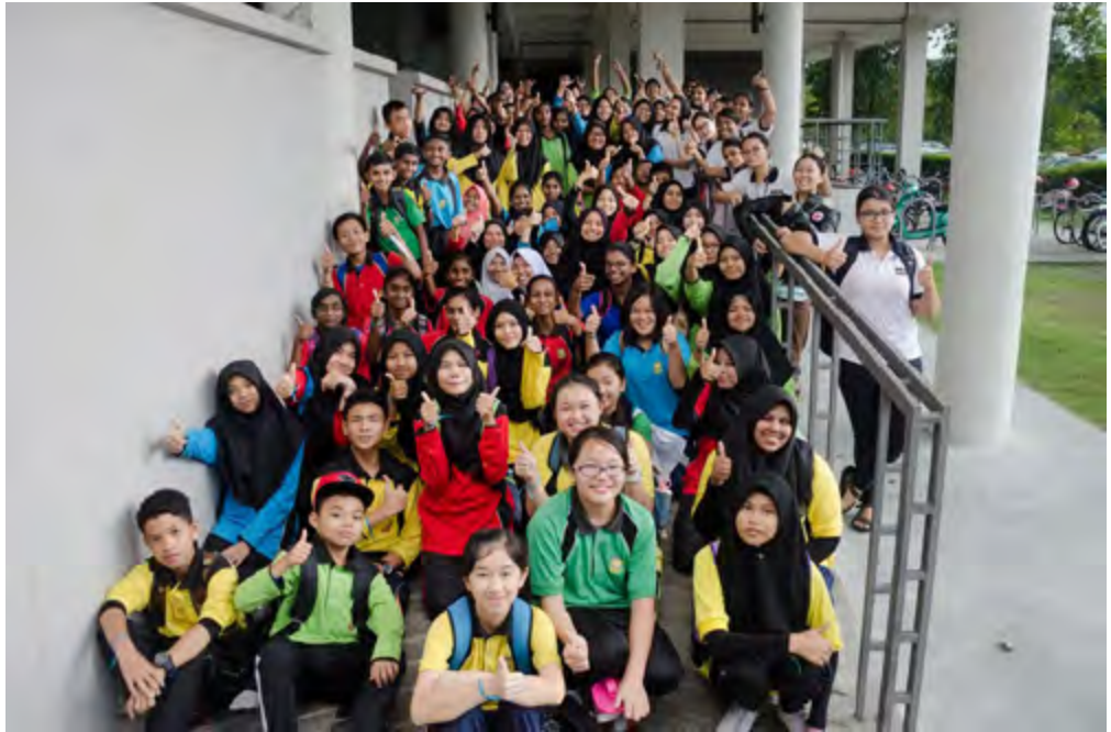
Para peserta bengkel bergambar dengan pelajar-pelajar UTAR