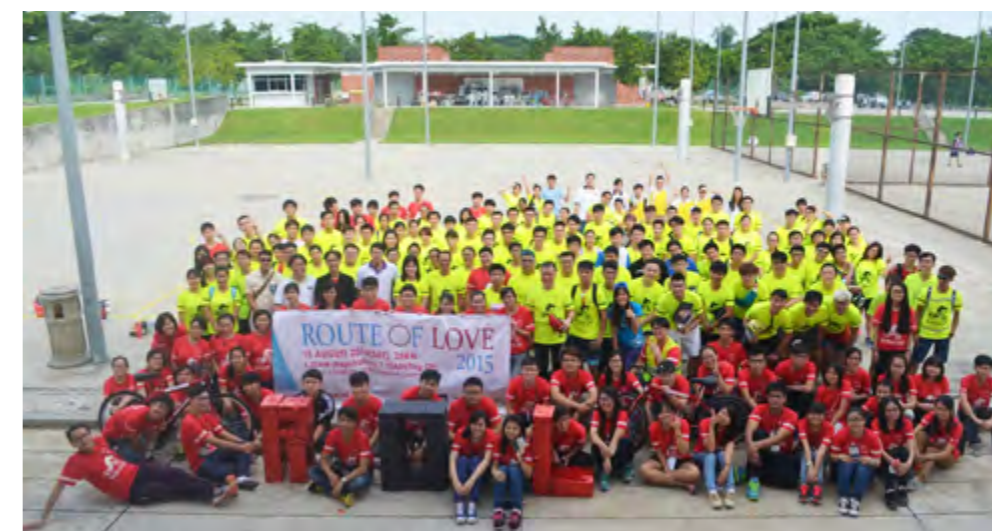
The VIPs, organising committee members and the participants