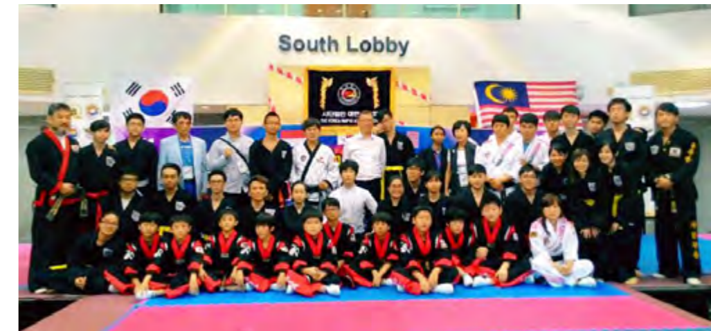
All smiles after the performance