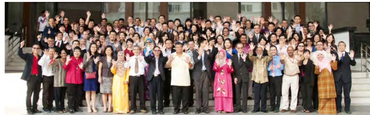
UTAR staff and the award recipients

UTAR was among the seven selected universities in the country to partner with Google Malaysia for the pilot launch of Google Ignite programme.