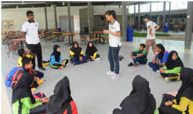
Sesi suai kenal sedang berlangsung