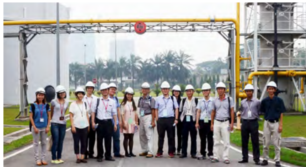
UST delegates and UTAR staff at BUNUS STP water treatment plant