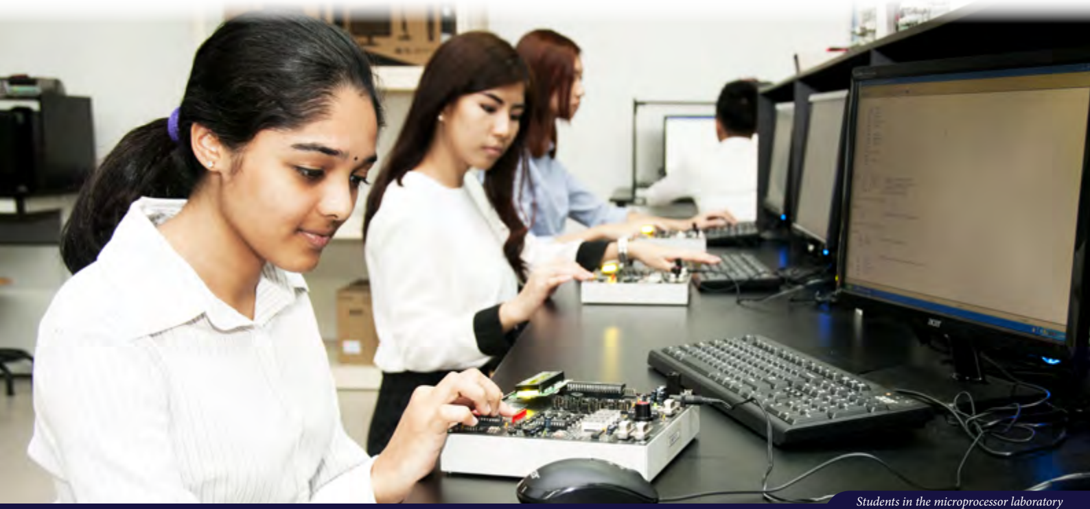
Students in the microprocessor laboratory