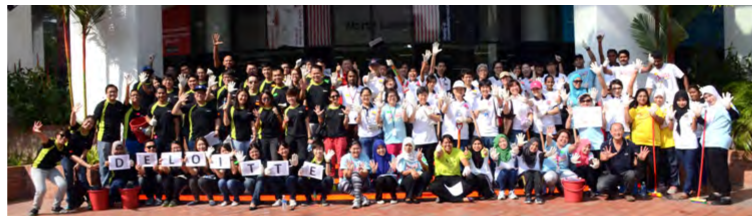
All the gotong-royong volunteers