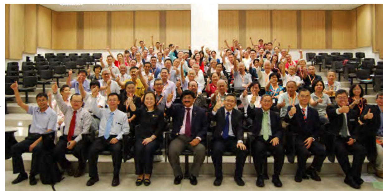
All the participants of the course