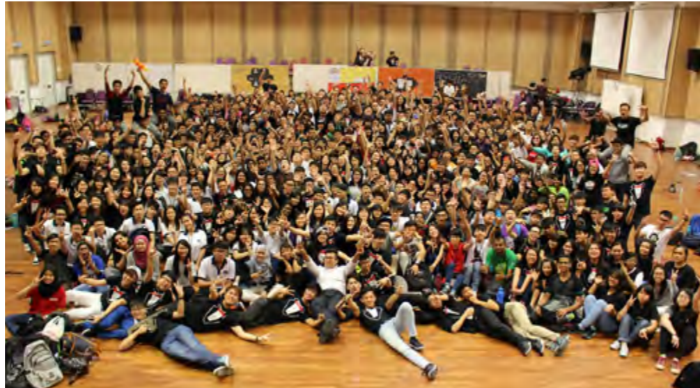
UTARians at the orientation held in UTAR Sungai Long Campus

"UTAR has established collaborations with many reputable universities and