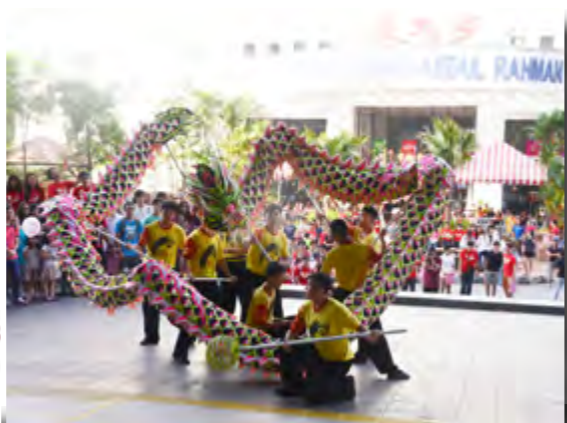
The auspicious dragon dance