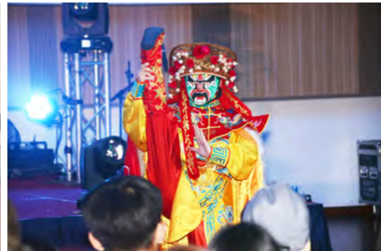
Dramatic Chinese art of face mask changing