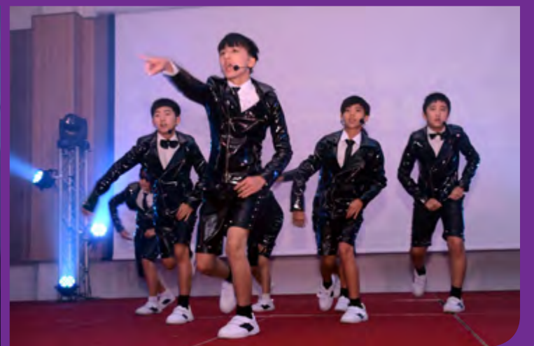
HIM, the youngest performers at the carnival