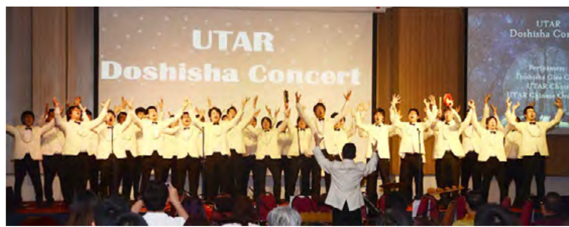
Doshisha Glee Club performing Kuniko, Kuniko (Come land, come land)

"It is an honour performing in Malaysia. This tour also acts as a cultural exchange that enables us to learn more