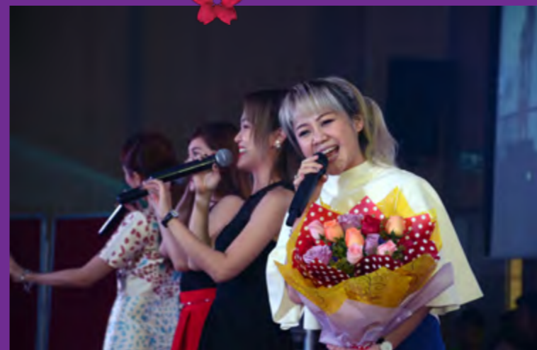
M-Girls performing CNY songs