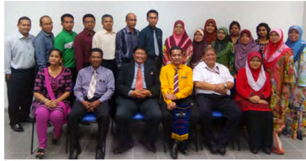
Participants with the organising committee

Attended by a total of 22 participants comprising school teachers from SMK Methodist (ACS) Kampar, the workshop covered relevant topics including the importance of using online educational resources in teaching, online teaching tools,