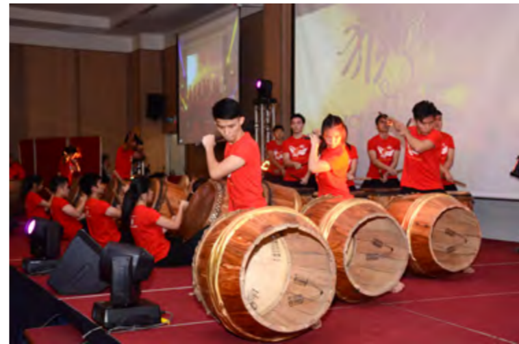
24 Festive Drums performance by UTAR students at the opening ceremony

UTAR Student Representative Council (SRC) together with UTAR Sungai Long Clubs and Societies jointly organised the Monsomeness Chinese New Year (CNY) Carnival on 31 January 2016 at the Sungai Long Campus. The joyful carnival saw some 5,000 visitors around the campus from 4pm to 11pm. The visitors included guests, students, staff, parents, shop owners, and residents from the surrounding communities in Sungai Long and Mahkota Cheras.