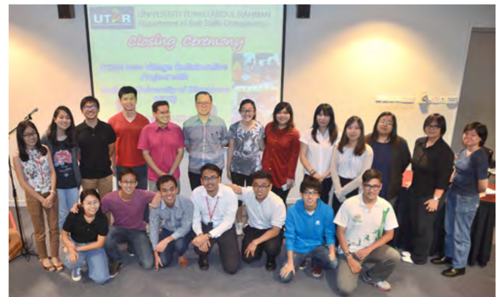
UTAR staff with the NUS students

eye-opening experience at Gua Musang. There were so many things to see and learn from the villagers and UTAR staff. It was interesting to learn that the villagers of Gua Musang depended on rubber tapping for their