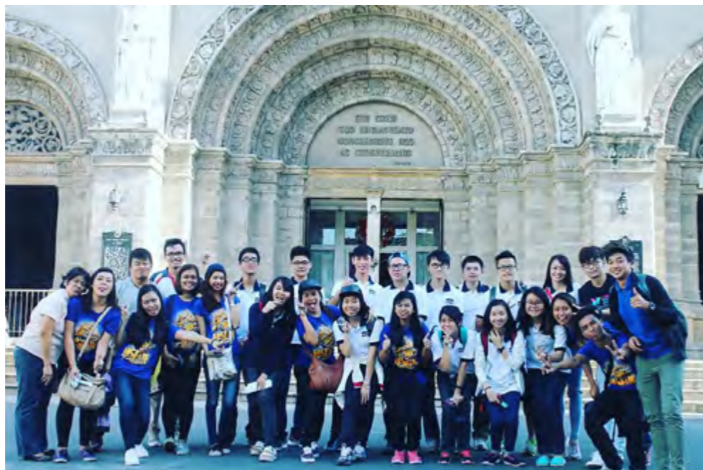
At the façade of the Manila Cathedral