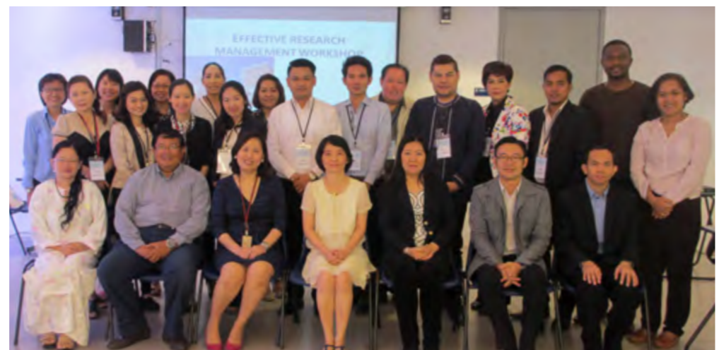
The participants and facilitators

their last day in Malaysia. They were briefed about the development of Putrajaya and explored various sites in the federal territory. This event was organised by UTAR's Institute of Management and Leadership Development and Institute for Postgraduate Studies and Research.