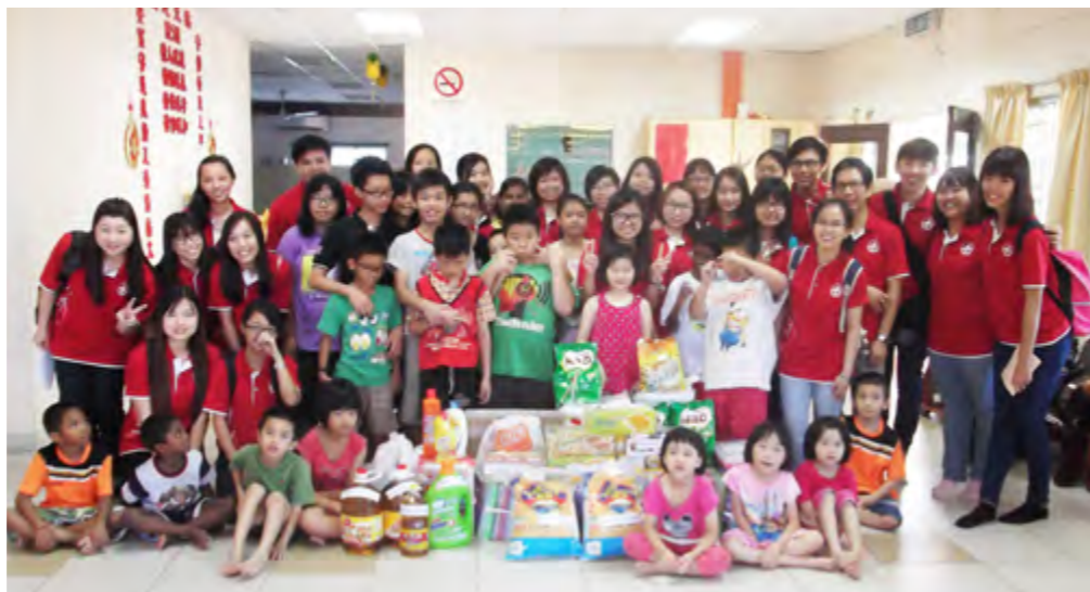
拉曼大学师生到访报恩寺安宁儿童之家派送佳节温暖。

这次的佳节送温暖活动旨在让学生有机会走入社区，为有需要帮助的人做一些力所能及的事，同时献上最真诚的爱心与温暖。他们为报恩寺安宁之家和安宁儿童之家送上佳节红包、日常用品、干粮、文具等。