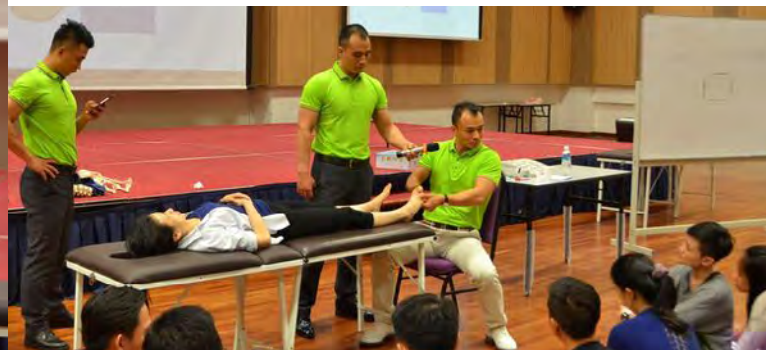
主讲人为学员们进行示范与讲解。