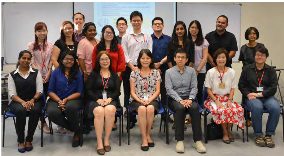
The presenters and participants all smiles before the start of the seminar