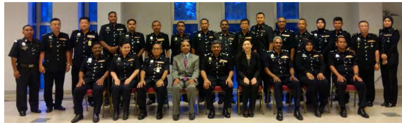
A representation of the close ties forged between UTAR and RMP

Besides the 30 senior-ranking Royal Malaysian Police (RMP) officers from the Perak State Police Contingent and District Police Headquarters of Perak, the workshop also saw participation of