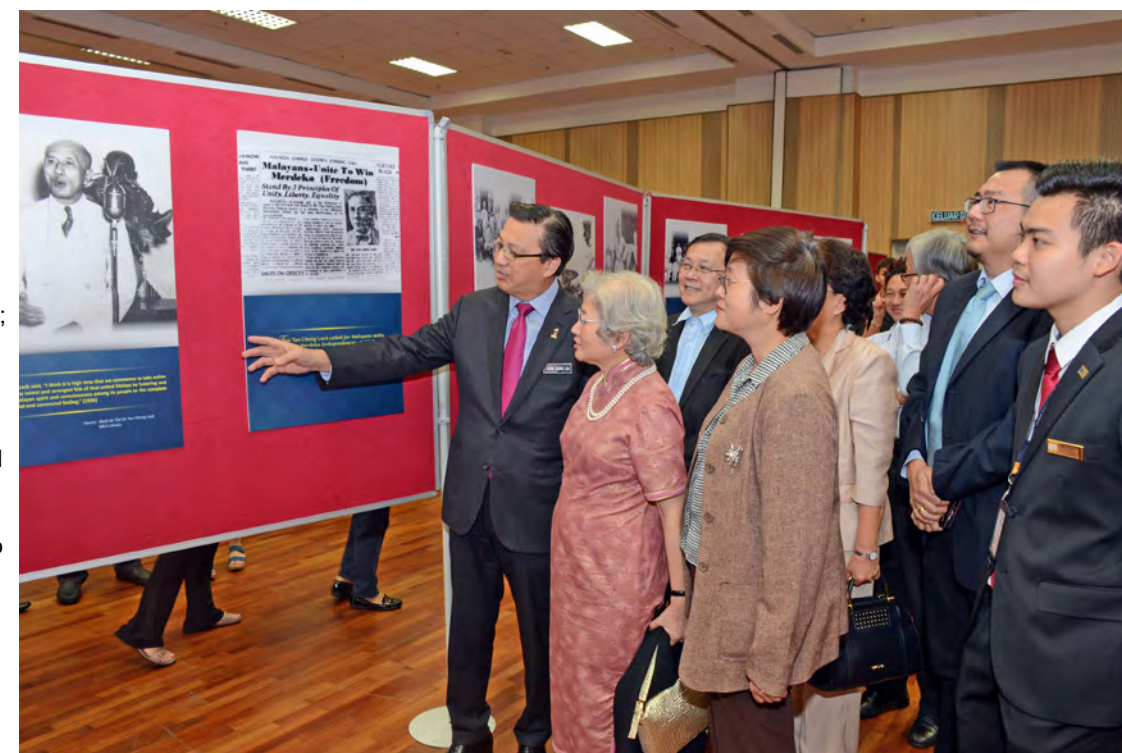
The guests admiring the exhibition on Tun Tan

The TCLC's vision is to be a centre of excellence that spearheads research for the betterment of Malaysia as a nation. Visit the TCLC's official website for more details: http://research.utar.edu.my/TCLC/index.html .