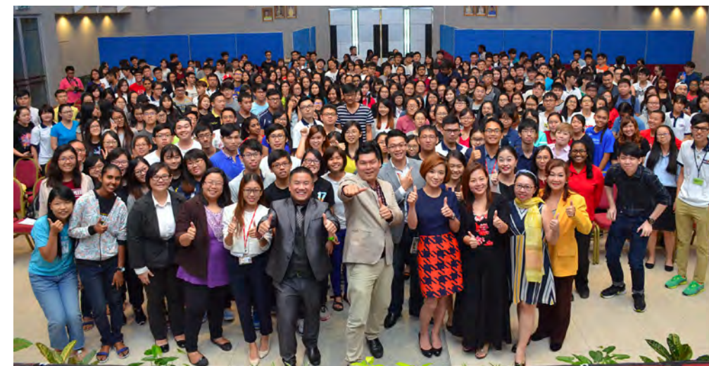
Speakers and participants at the end of the forum

Tay shared, "It is important for a leader to have good communication skills because you cannot influence someone without