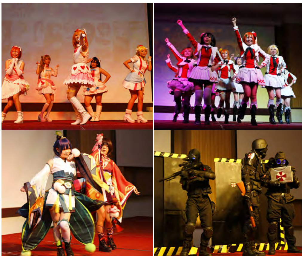
Some of the dance performances (top) and costume competition entrants (bottom)

Cosplay (コスプレ), a contraction of the words costume and play , is a performance art where a participant (known as a cosplayer), dresses up in costumes and accessories to represent a specific character from manga , anime , comic books, cartoons, video games, films or television series.