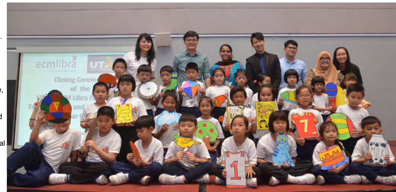
School students with their instructors