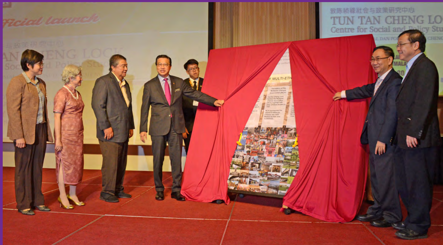
The VIPs officially launching the centre

As a tribute to one of the country's founding fathers and the first President of the Malaysian Chinese Association (MCA), UTAR launched the Tun Tan Cheng Lock Centre for Social and Policy Studies (TCLC) in its Sungai Long Campus on 28 February 2017.