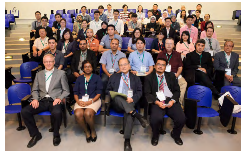
The organising committee and some of the participants