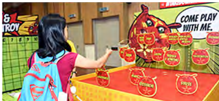
Antara aktiviti yang dijalankan semasa kempen

Selain daripada ceramah, pelbagai aktiviti lain turut dianjurkan oleh pihak penganjur. Antaranya ialah, stesen-stesen permainan, tapak pameran, kuiz, bengkel langkah pencegahan denggi dan sebagainya. Para pelajar dan kakitangan UTAR digalakkan untuk mengambil bahagian dalam aktiviti-aktiviti yang dianjurkan khususnya untuk meningkatkan kesedaran mengenai wabak denggi.