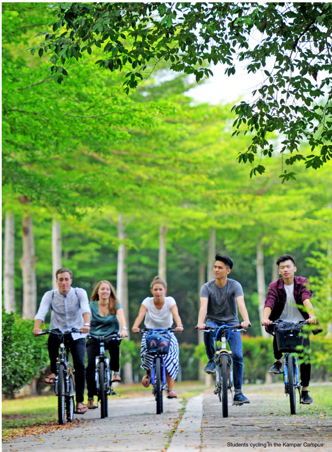
Students cycling in the Kampar Campus

• Broadening Horizons, Transforming Lives •