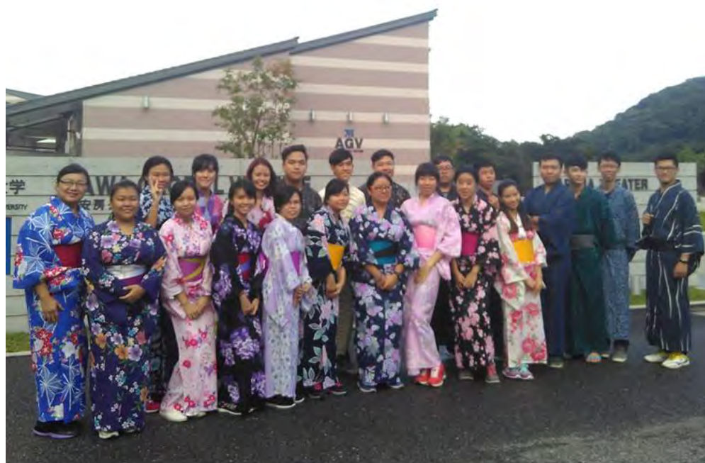
The students in their kimonos

Not forgetting leisurely activities, students had fun with visits to Kamogawa's Sea World, promenade, shrine and the observatory deck. Time was also allocated