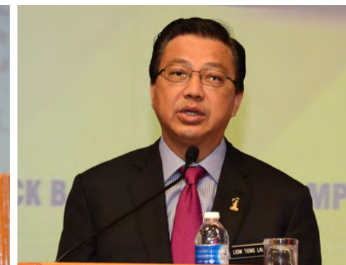
Dato' Sri Liow emphasising the importance of unity in Malaysia