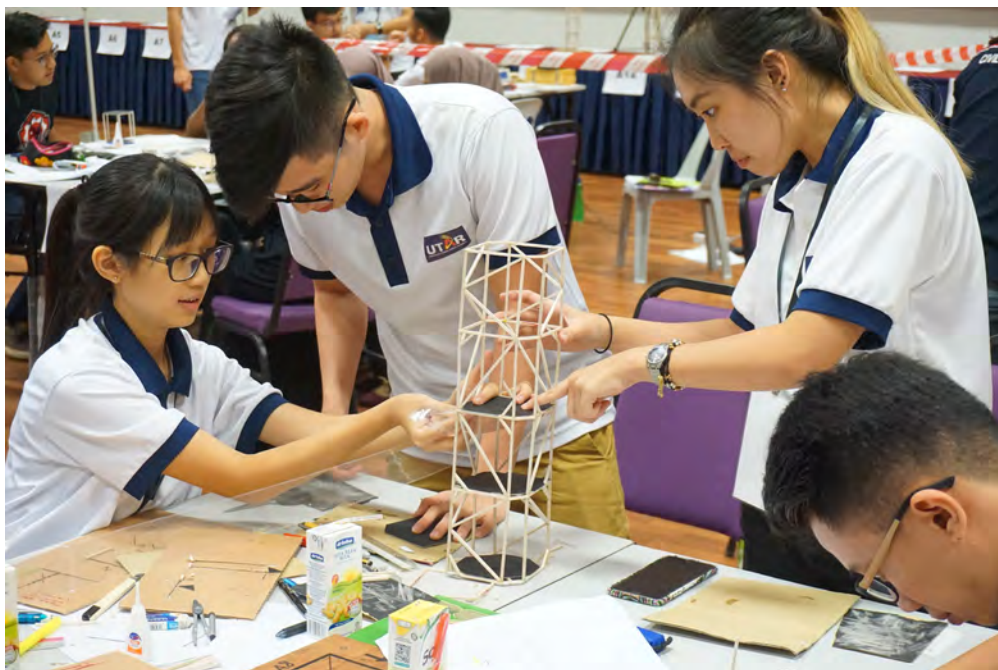
Team Anything constructing their model