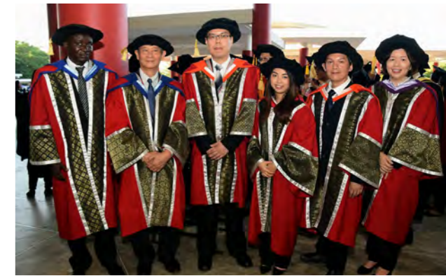
UTAR PhD graduates