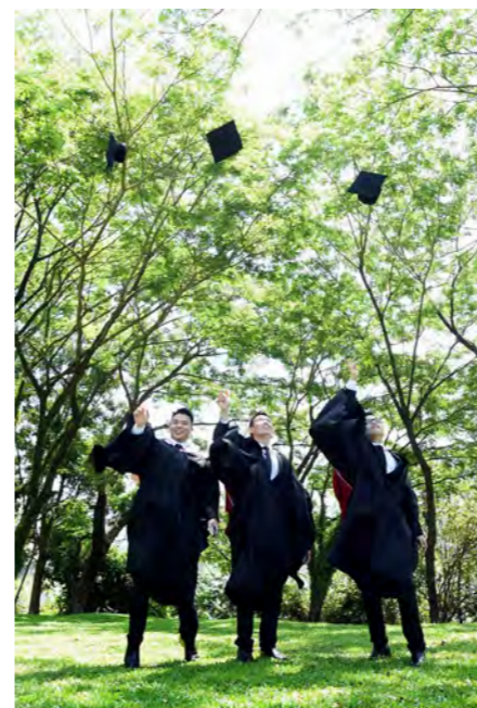
Graduates in jubilant mood