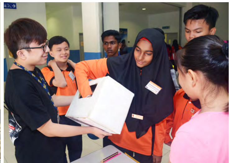
Antara aktiviti menarik yang dijalankan sepanjang Kem tersebut

Penguasaan bahasa Inggeris dalam kalangan pelajar sentiasa menerima perhatian daripada semua pihak dan ini sejajar dengan aspirasi sistem pendidikan di Malaysia yang ingin melahirkan individu yang mampu menguasai bahasa Inggeris bagi membolehkan mereka berdaya saing di peringkat global. Bagi mendokong aspirasi tersebut, Pusat Pendidikan Lanjutan UTAR (CEE) telah menganjurkan Kem Bahasa Inggeris yang disertai oleh 330 pelajar sekolah menengah pada 17 March 2018 di Kampus Sungai Long.