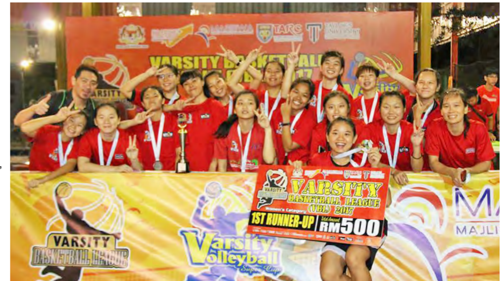
The first runner-ups posing with their medals and mock cheque