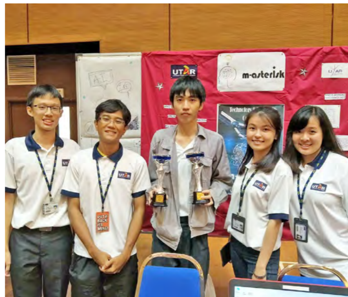
"M-Asterisk" won the Best Design and Best Idea awards

UTAR Psychology students from the Faculty of Arts and Social Science won the Best Design Award and Best Idea Award in the 2nd INTI PSYCHOMECH competition. It was held at INTI International University, Nilai on 6 and 7 April 2018.