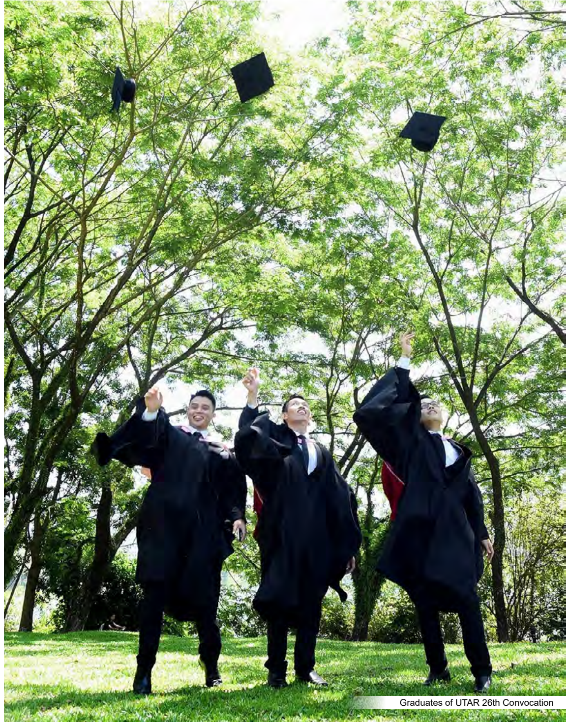
Graduates of UTAR 26th Convocation