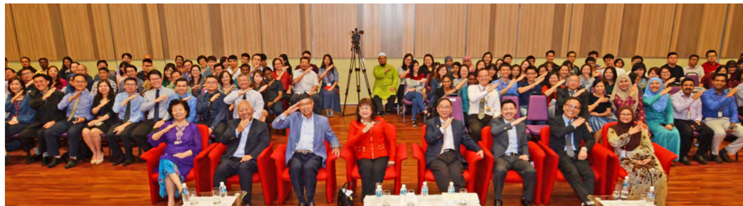
Group photo after the launch

With the support from Silverlake, UTAR launched the Key Generation of UTAR integrated Cumulative Grade Point Average (iCGPA) and Blockchain Certification System. It was held at Sungai Long Campus on 9 February 2018.