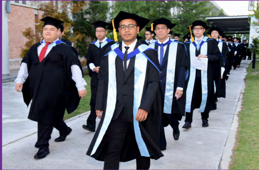
Graduands marching their way to Dewan Tun Dr Ling Liong Sik

UTAR welcomed a total of 2,914 new graduates into the family of UTAR alumni at the UTAR's 26th Convocation ceremony which was held from 9 to 11 March 2018 at the Dewan Tun Dr Ling Liong Sik of Kampar Campus. It was a celebration of the graduands' perseverance, determination and their dedication to the ideals of UTAR.