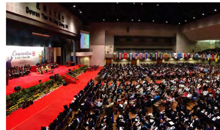
Graduands and their parents at the UTAR 26th Convocation