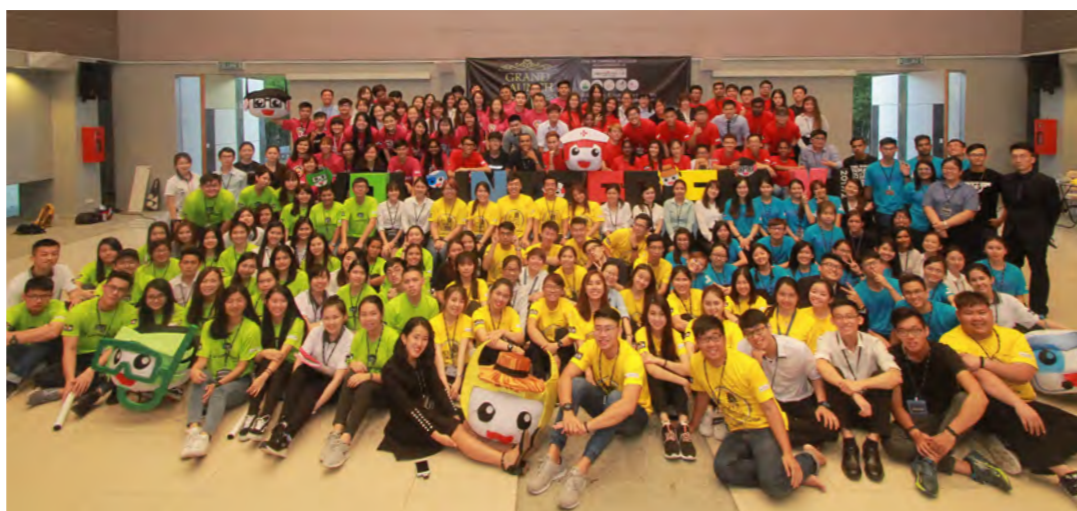
All smiles after the grand launch