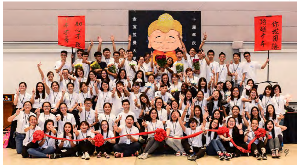
The Organising Committee of the UTAR Buddhist Society (Kampar Campus)

things around us, it is easier for us to control our mind regardless of how turbulent a situation can be."