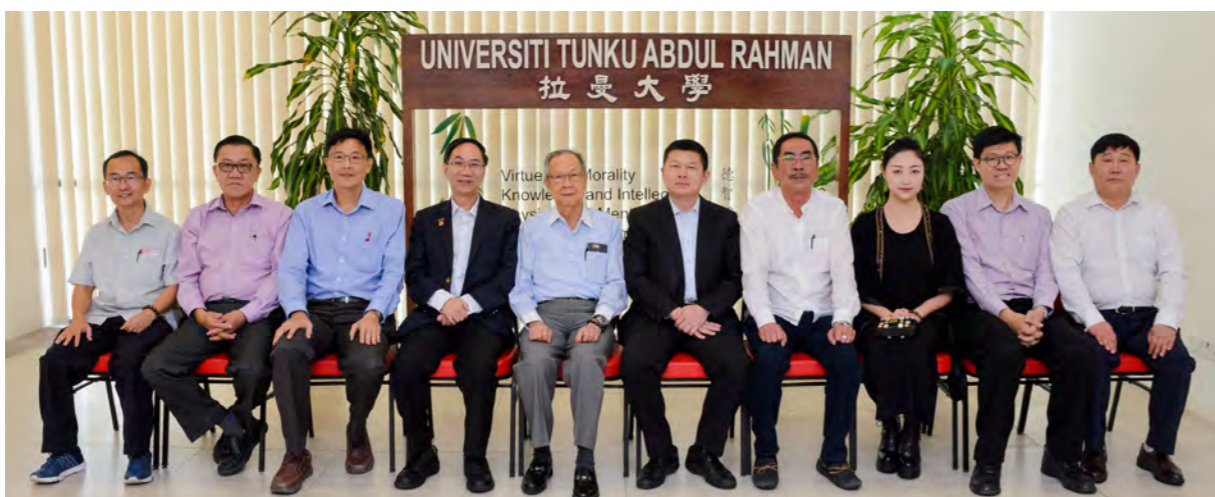
Delegates of the Trade Exchange Day