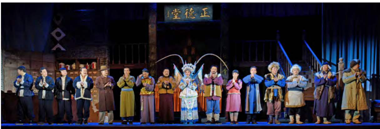
"The Secret Recipe" troupe of performers from Liaoning at Tun Ling Hall