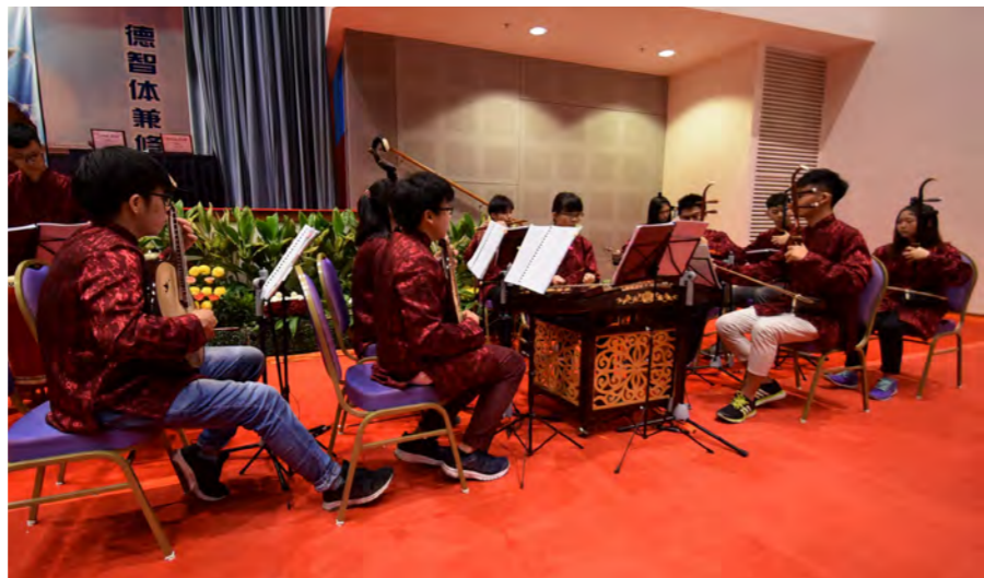
Chinese orchestra performance