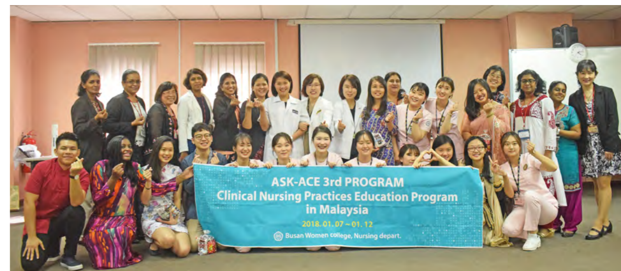
UTAR staff and the nursing students

UTAR also embarked on a collaborative journey with the Busan Women's College (Korea) by signing a memorandum of understanding (MoU). Both parties