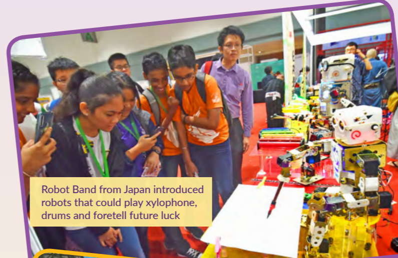
Robot Band from Japan introduced robots that could play xylophone, drums and foretell future luck