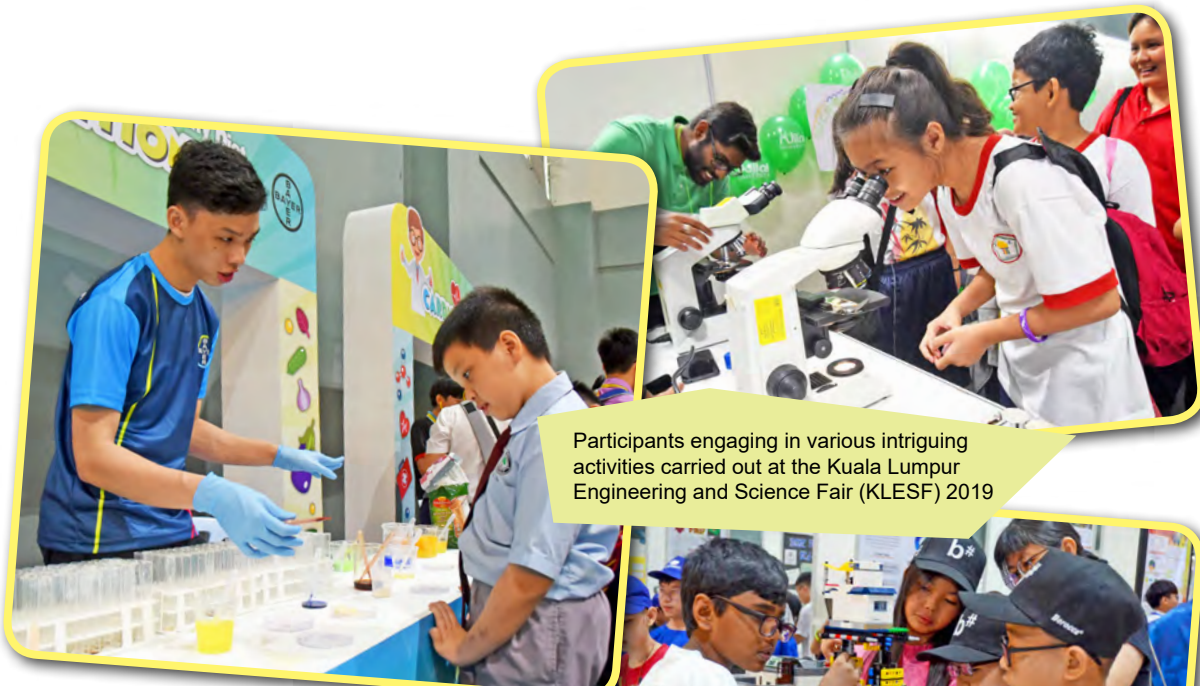
Participants engaging in various intriguing activities carried out at the Kuala Lumpur Engineering and Science Fair (KLESF) 2019