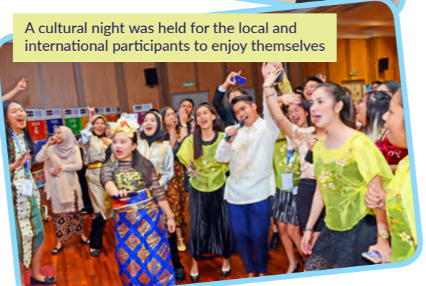
A cultural night was held for the local and international participants to enjoy themselves