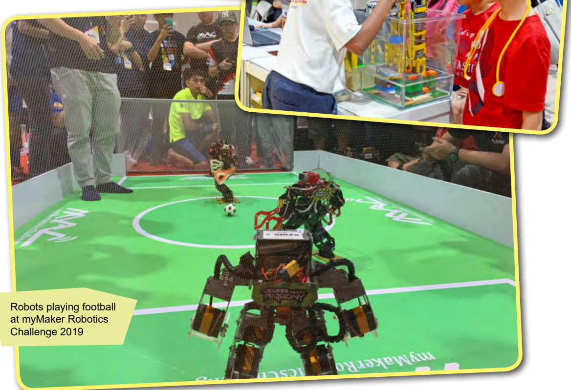
Robots playing football at myMaker Robotics Challenge 2019