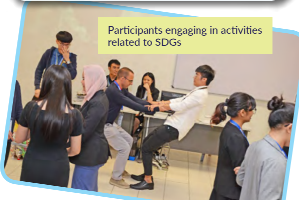
Participants engaging in activities related to SDGs