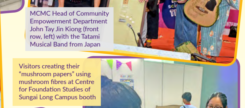
Visitors creating their "mushroom papers" using mushroom fibres at Centre for Foundation Studies of Sungai Long Campus booth