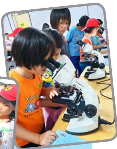
Pelajar-pelajar berseronok melakukan aktiviti-aktiviti sains amali