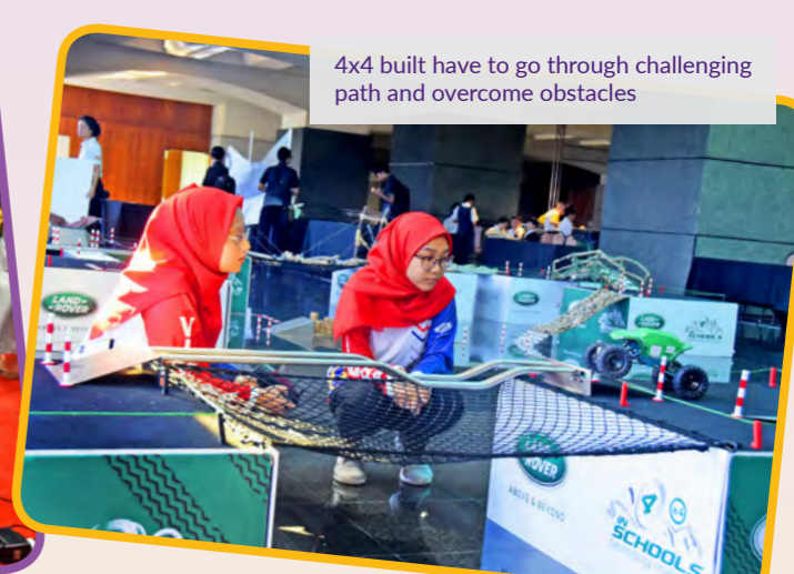
4x4 built have to go through challenging path and overcome obstacles