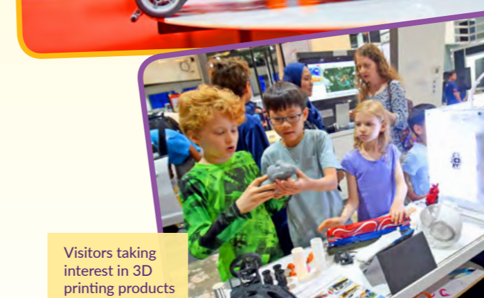
Visitors taking interest in 3D printing products