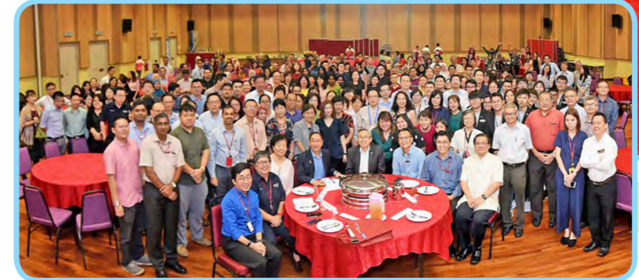
Farewell luncheon at Sungai Long Campus