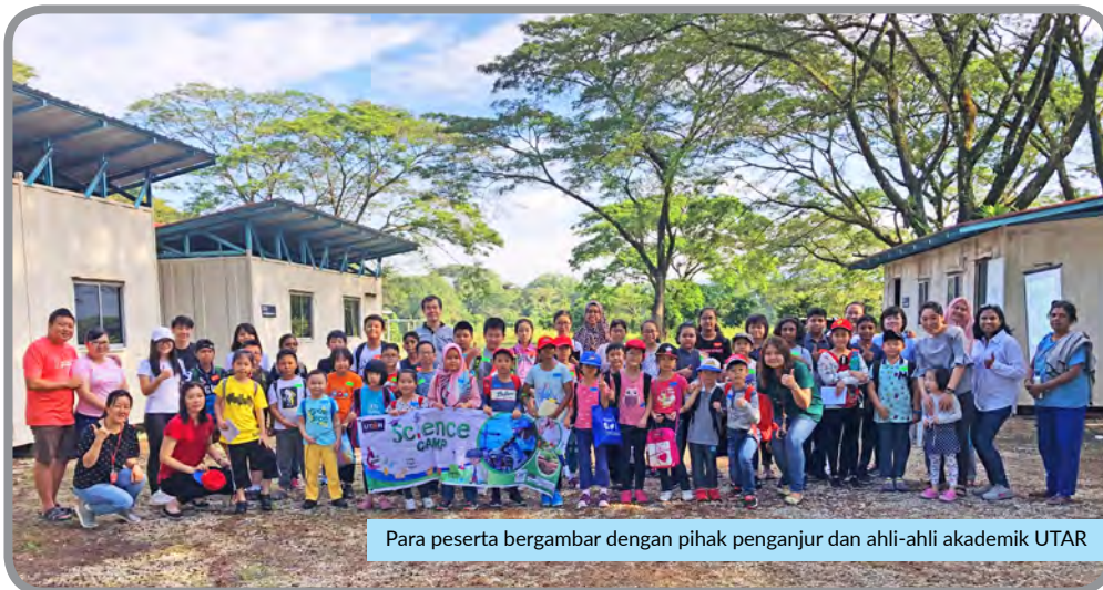
Para peserta bergambar dengan pihak penganjur dan ahli-ahli akademik UTAR

Kem Sains yang berteraskan pelbagai aktiviti praktikal STEM tersebut memberi peluang kepada pelajar-pelajar sekolah mempelajari kaedah-kaedah sains yang terlibat dalam bidang penanaman, penternakan, pemprosesan makanan dan pemprosesan bahan gunaan harian seperti sabun. Kem tersebut juga memberi peluang kepada semua peserta untuk melawat dan mengendalikan eksperimen mereka di tapak pertanian UTAR