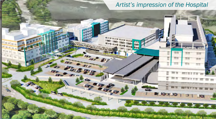
Artist's impression of the Hospital

UTAR is indeed thankful for your support and donation to our UTAR Hospital. Your kindness and generosity have made the construction of the hospital that much closer to the reality of completion. We will continue with our efforts to ensure that the hospital is completed as planned to serve its purpose for the community.