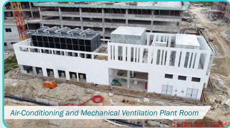
Air-Conditioning and Mechanical Ventilation Plant Room