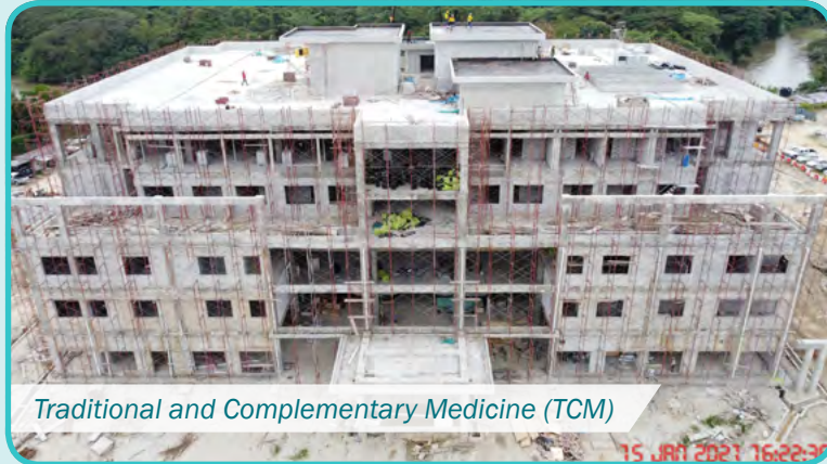
Traditional and Complementary Medicine (TCM)