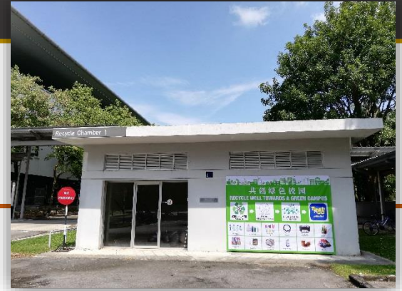
Green Bank UTAR (located beside the motorbike parking area, FEGT)

Green Bank project is a result of collaboration between UTAR and Go Greenonline Sdn. Bhd. The Go Greenonline Sdn. Bhd. has years of successful experience in dealing with recycling work in Pangkor Island.