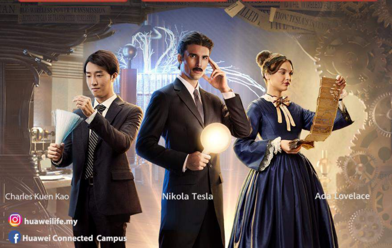
Charles Kuen Kao